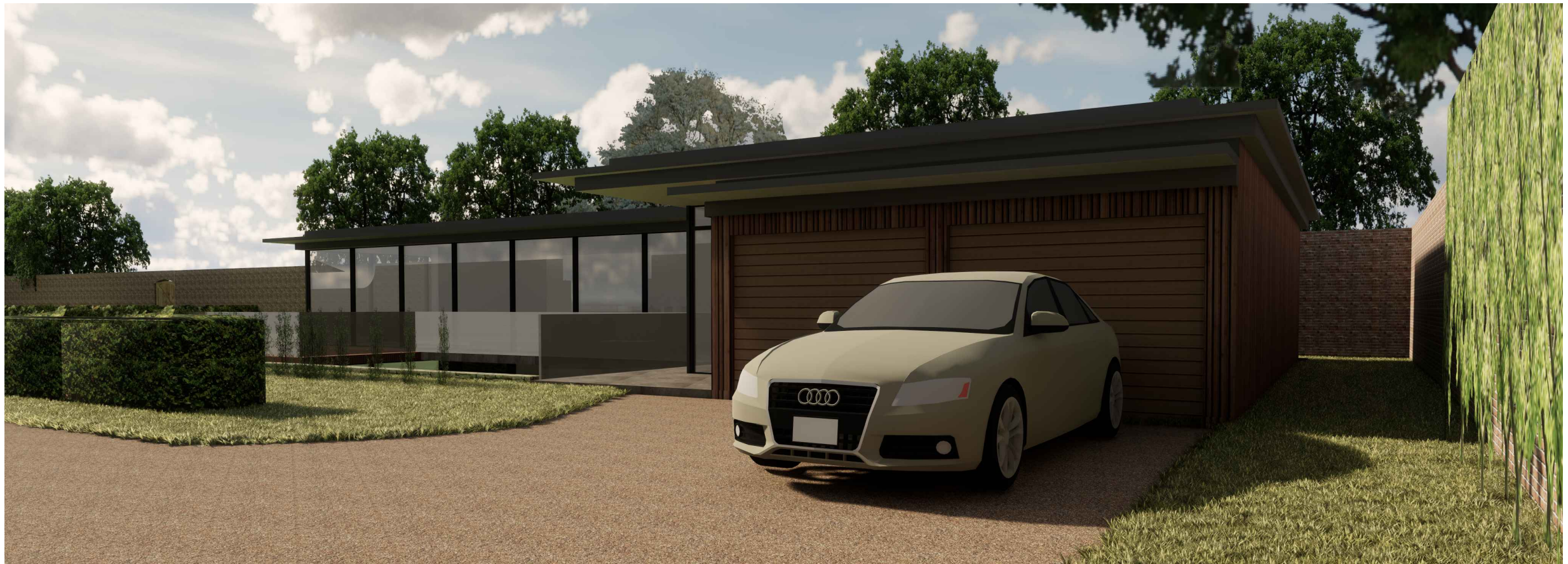
PROPOSED FRONT 3D VIEW, WALLED GARDEN