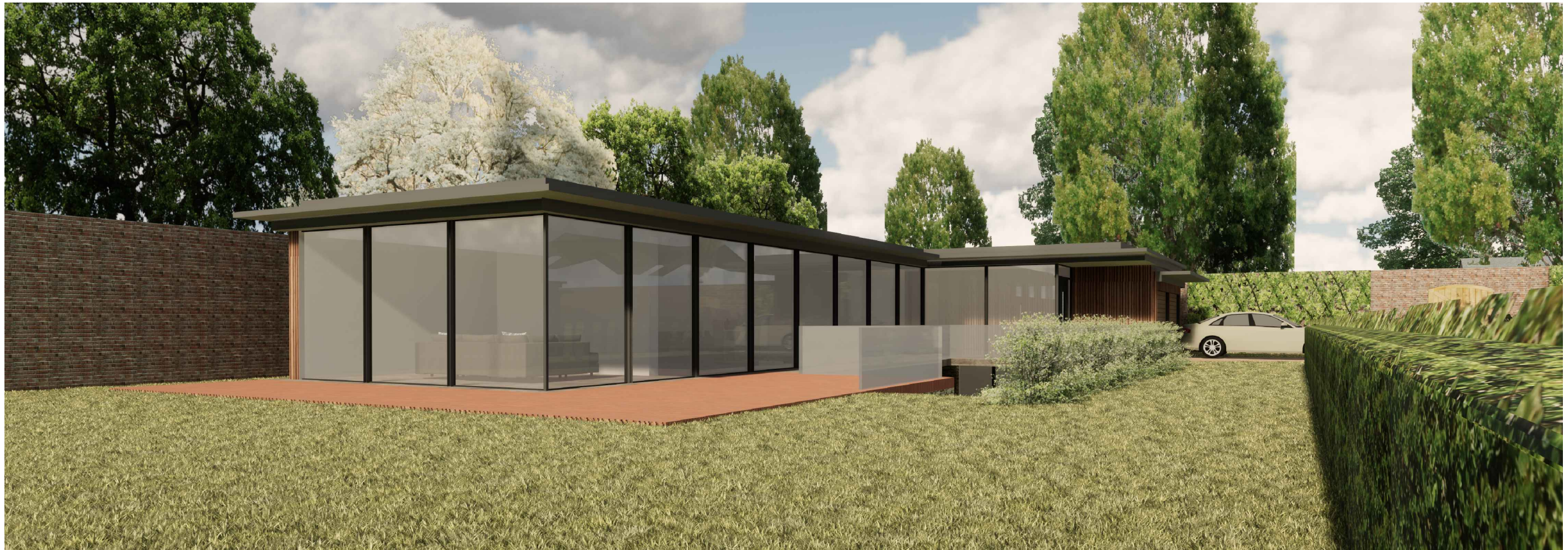
PROPOSED GARDEN 3D VIEW, WALLED GARDEN