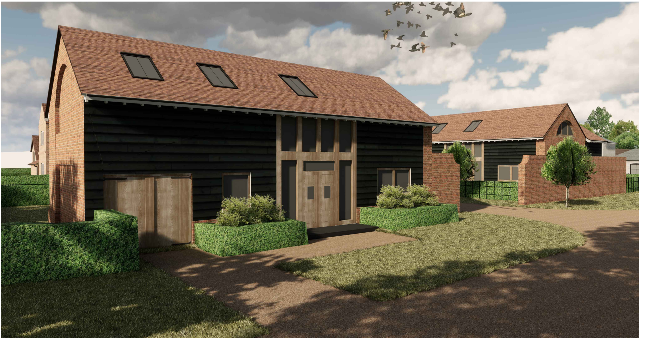
PROPOSED FRONT 3D VIEW, SETTLEMENT UNIT 1