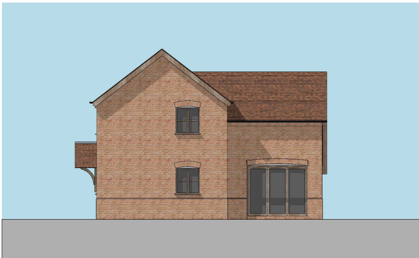
PROPOSED SOUTH ELEVATION, DAIRY