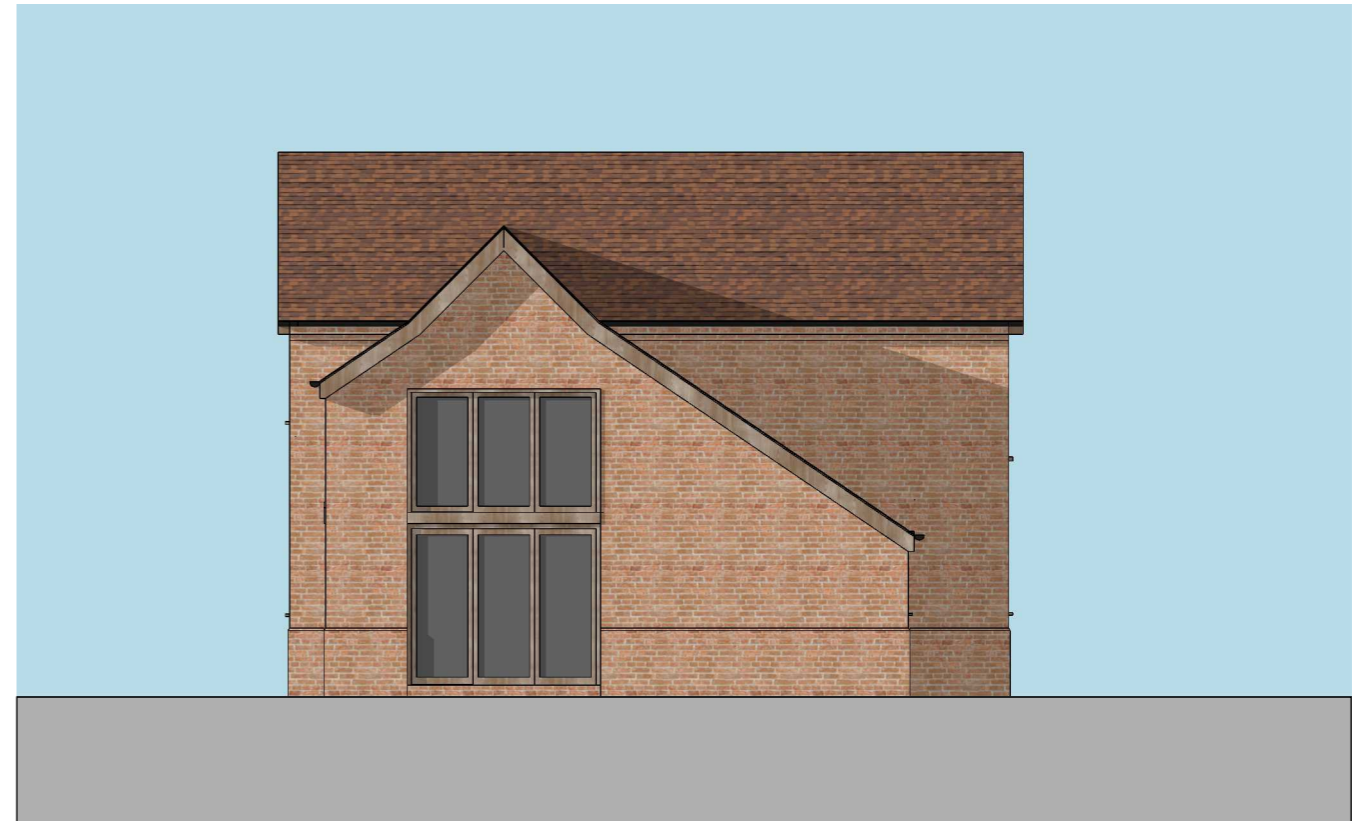
PROPOSED EAST ELEVATION, DAIRY