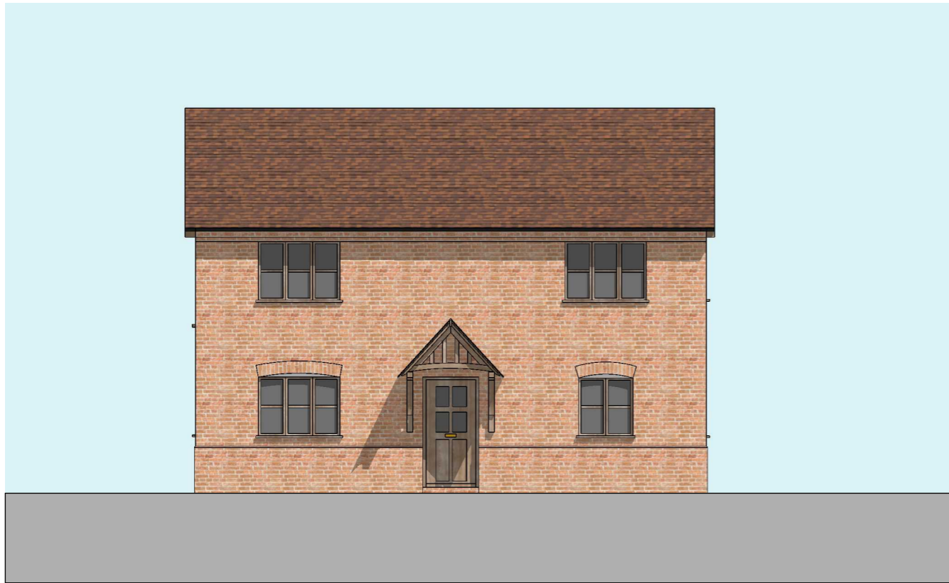
PROPOSED FRONT/WEST ELEVATION, DAIRY