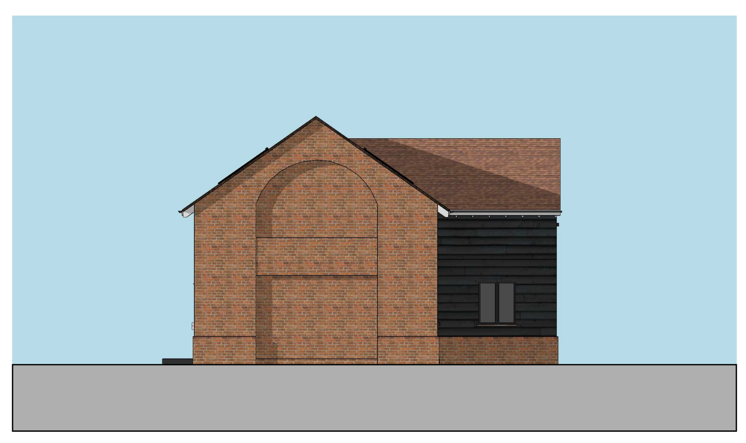
PROPOSED SIDE 1 ELEVATION, SETTLEMENT UNIT 1