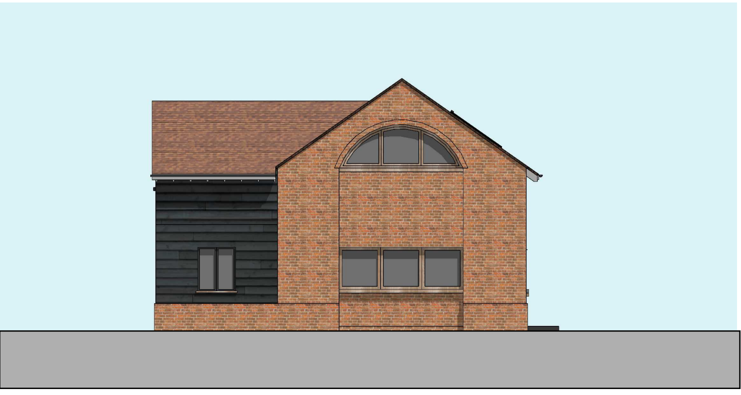
PROPOSED SIDE 2 ELEVATION, SETTLEMENT UNIT 1