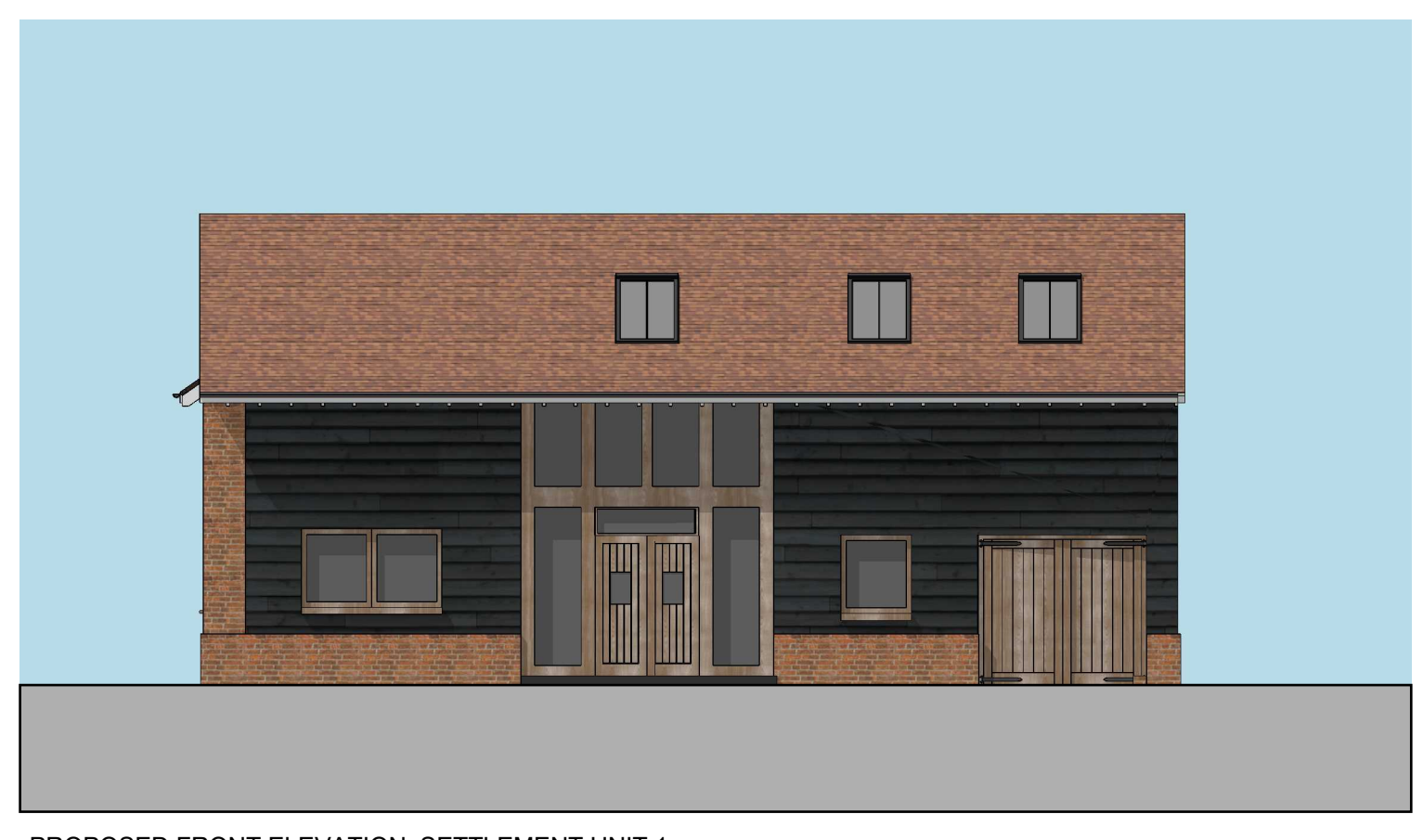
PROPOSED FRONT ELEVATION, SETTLEMENT UNIT 1