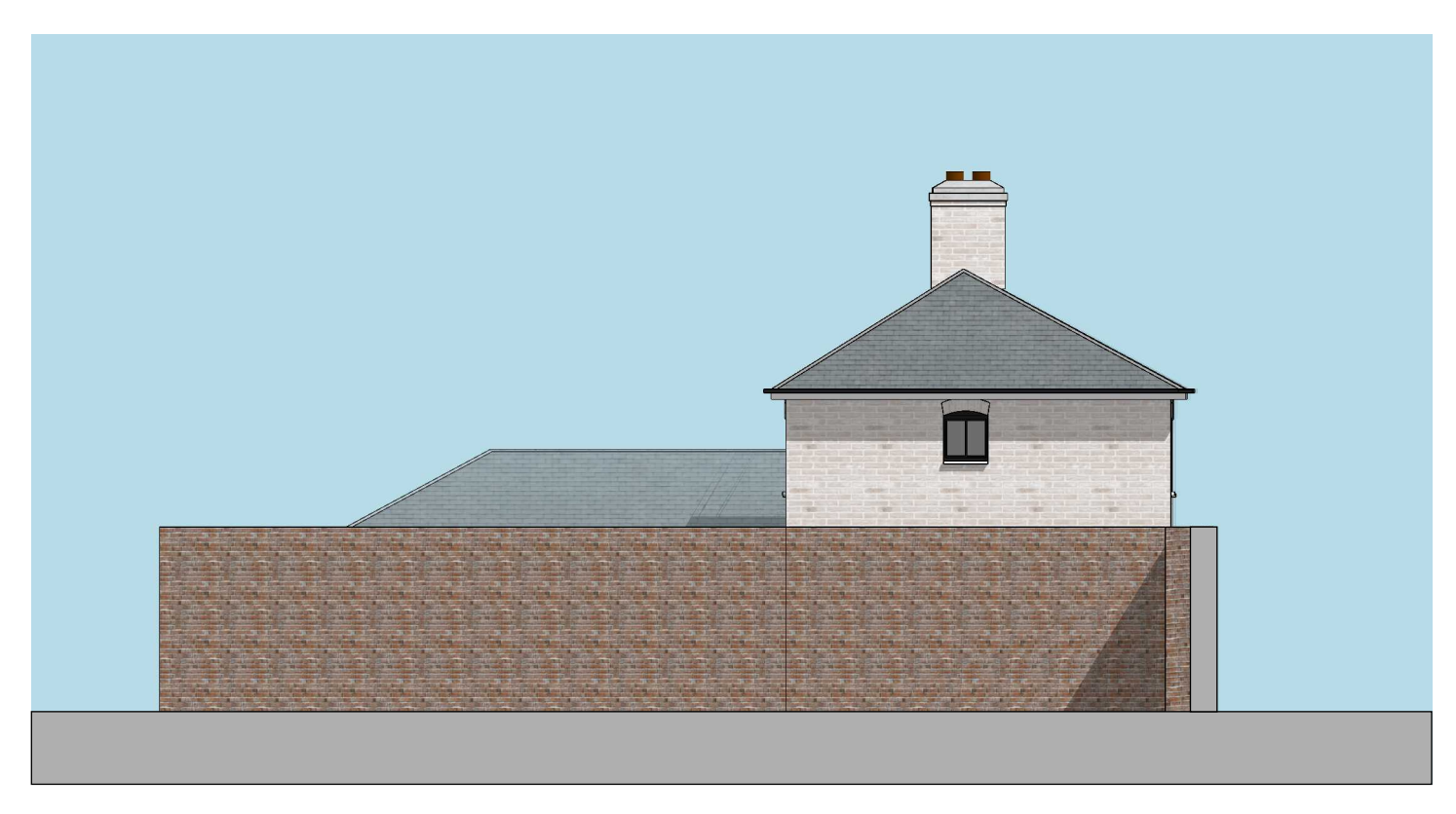
PROPOSED SOUTH ELEVATION, OAK COTTAGE