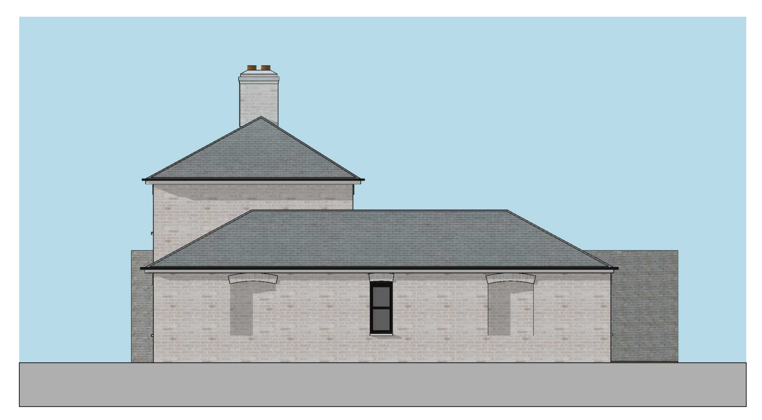
PROPOSED NORTH ELEVATION, OAK COTTAGE