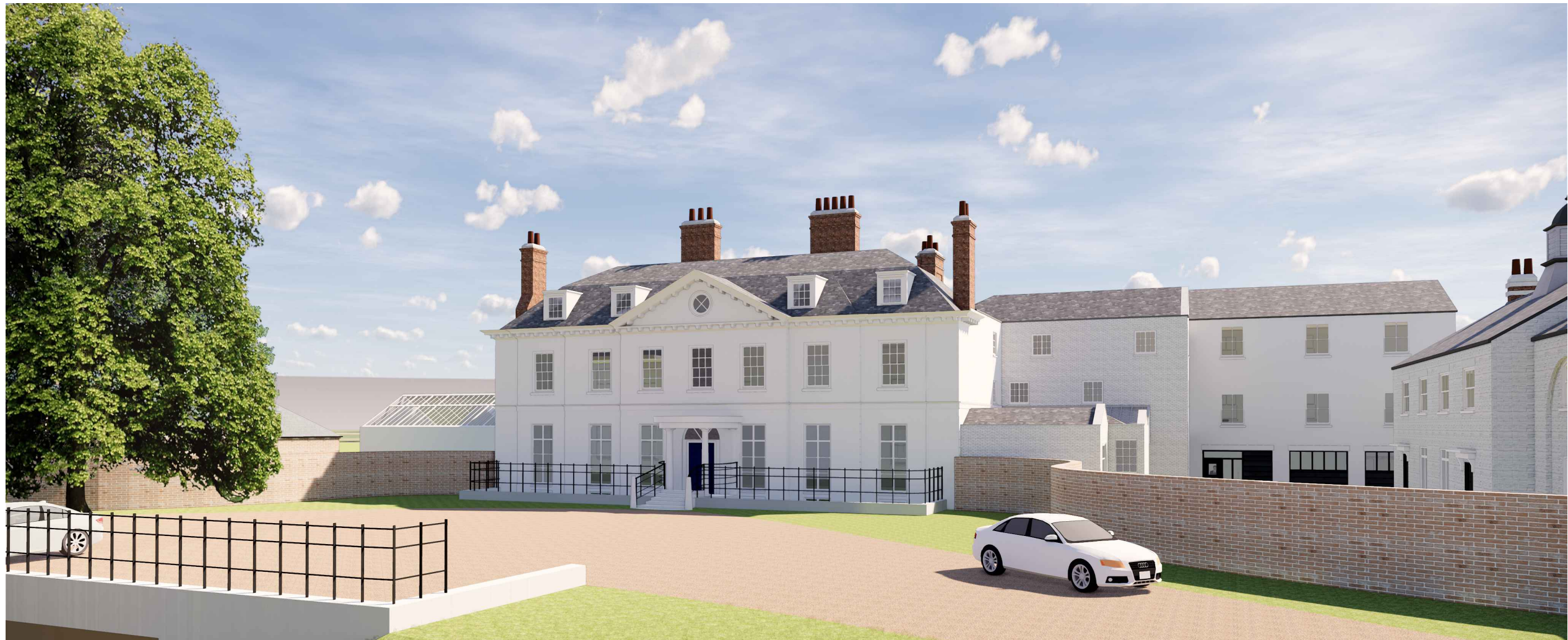
PROPOSED FRONT 3D VIEW, NORTHAW HOUSE