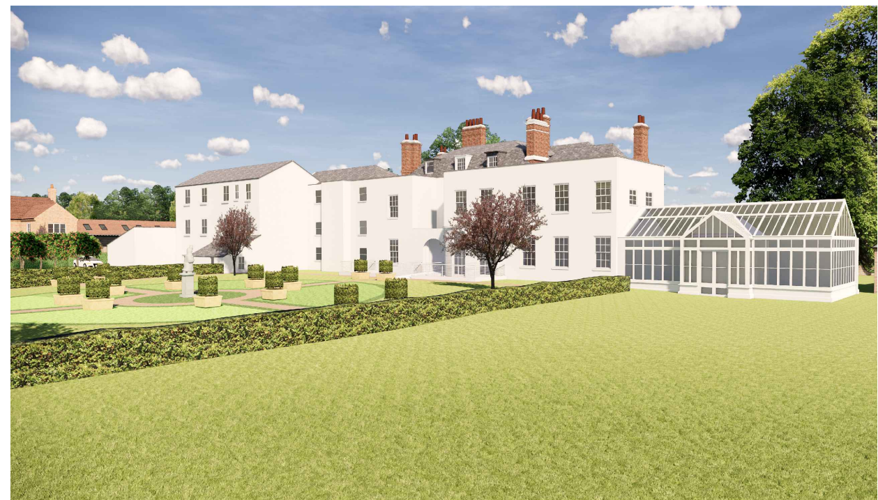
PROPOSED BACK 3D VIEW 2, NORTHAW HOUSE