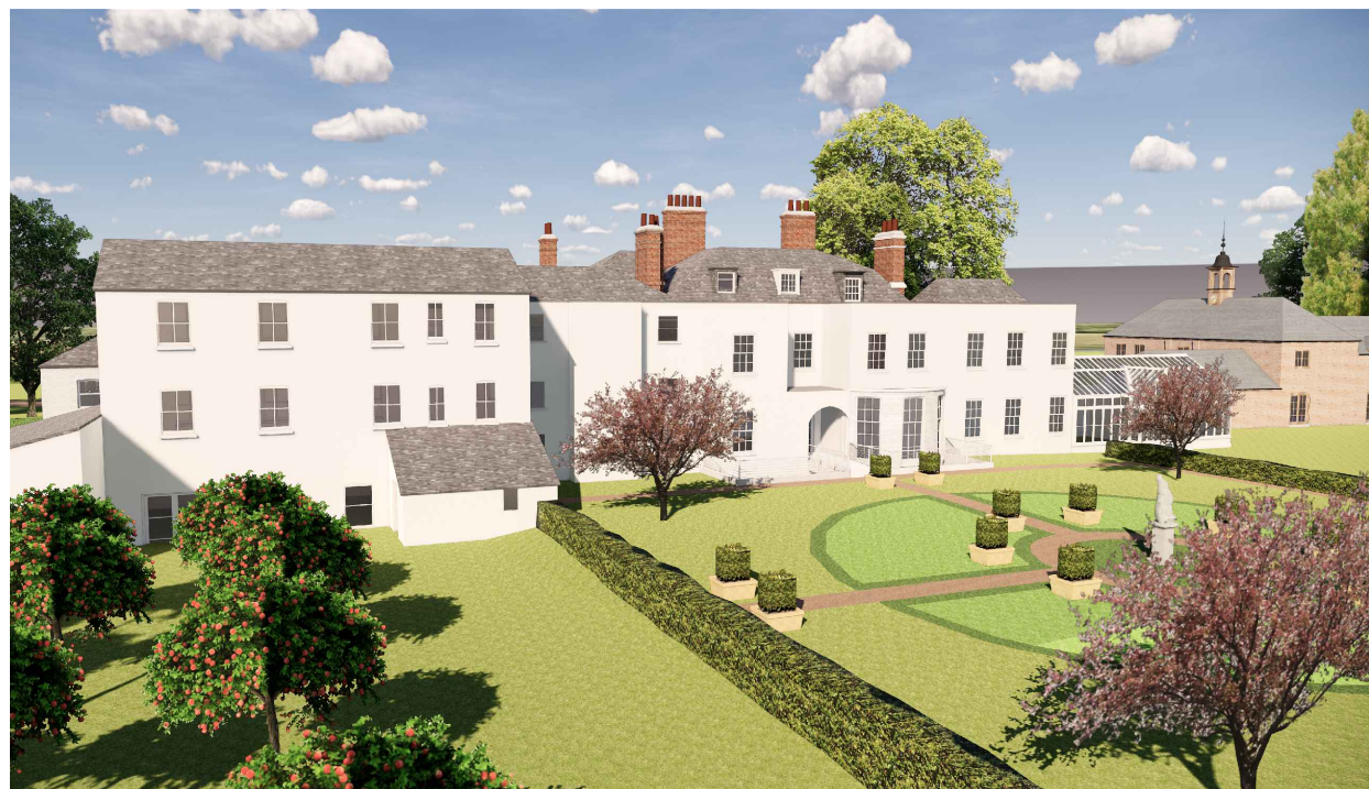
PROPOSED BACK 3D VIEW, NORTHAW HOUSE