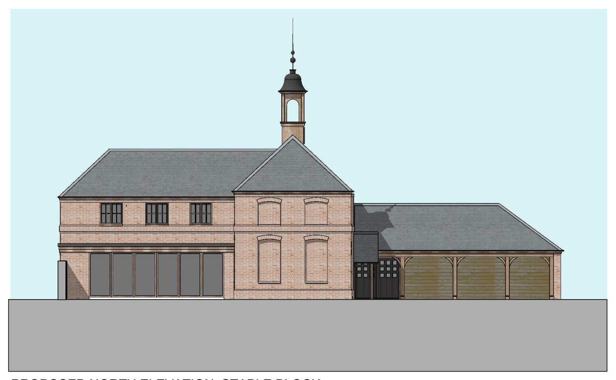
PROPOSED NORTH ELEVATION, STABLE BLOCK