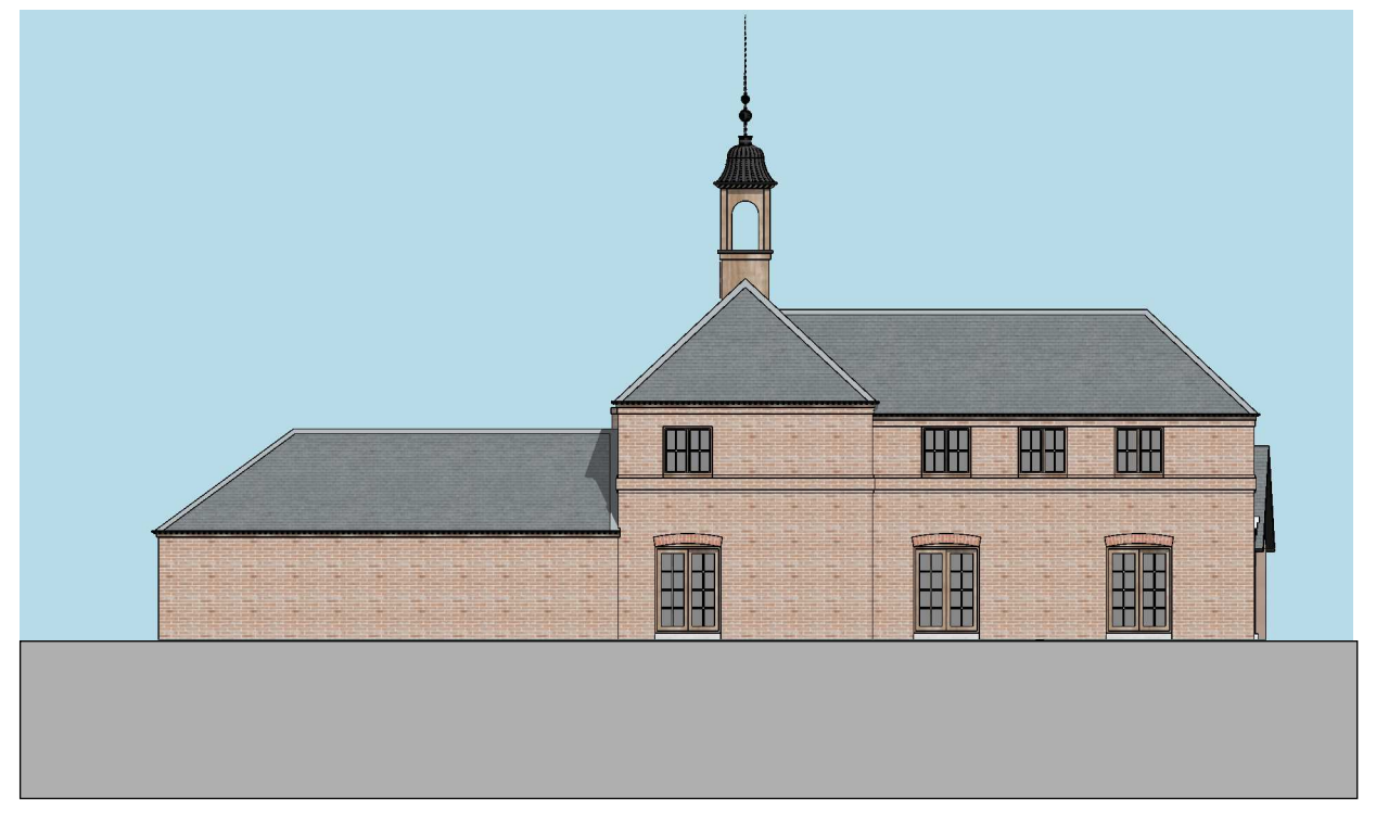
PROPOSED SOUTH ELEVATION, STABLE BLOCK