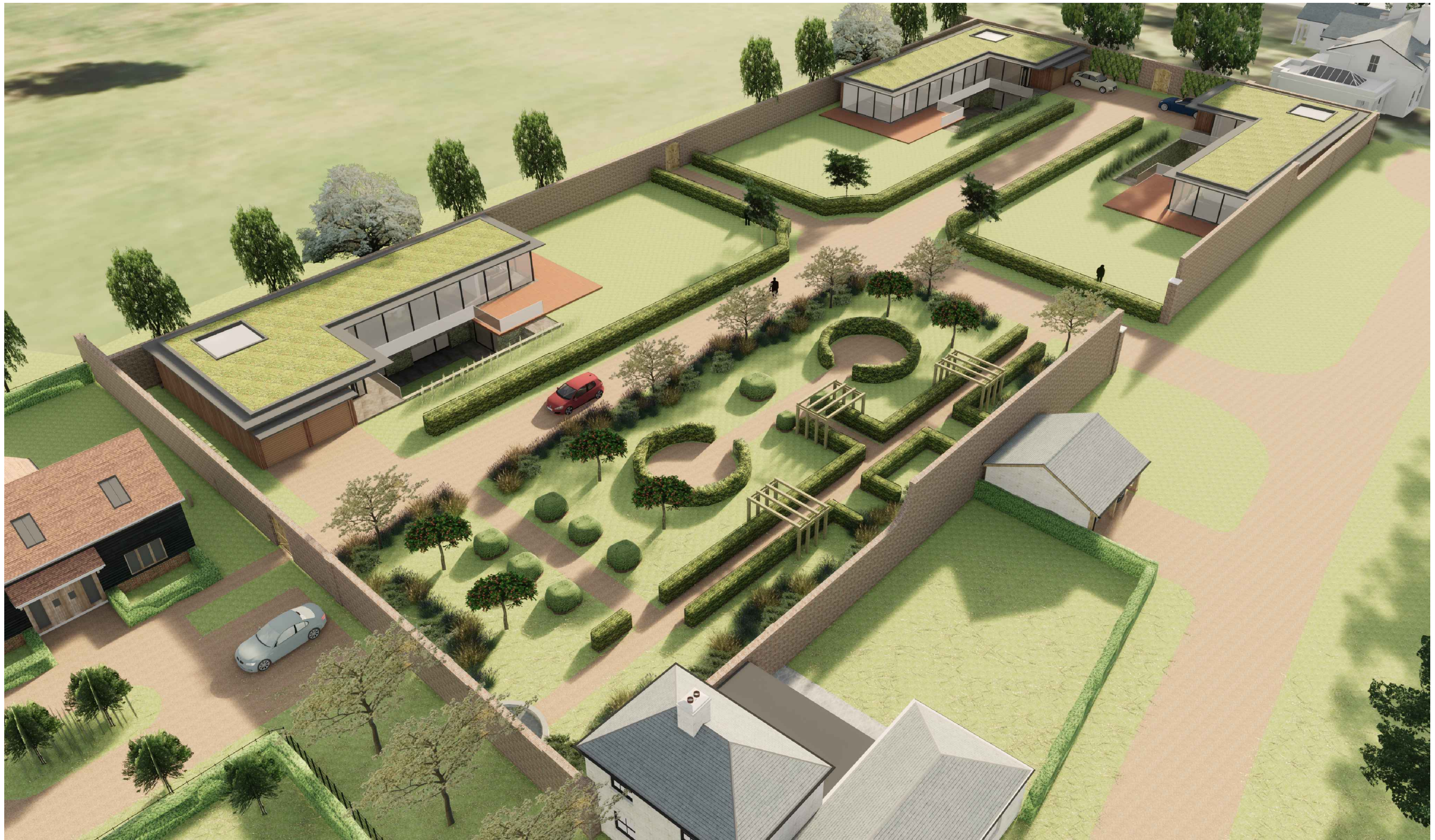
PROPOSED AERIAL VIEW, WALLED GARDEN