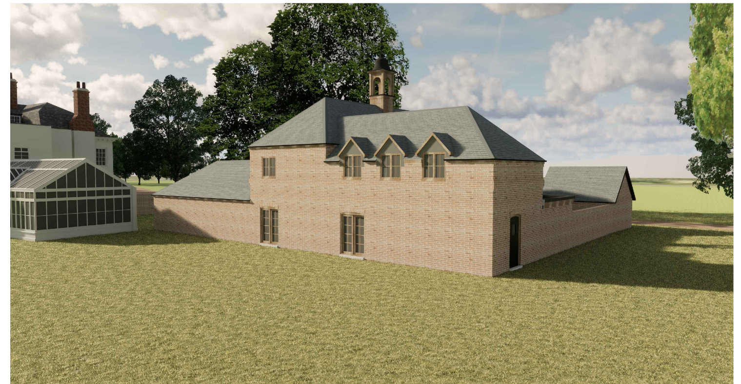
PROPOSED BACK 3D VIEW, STABLE BLOCK