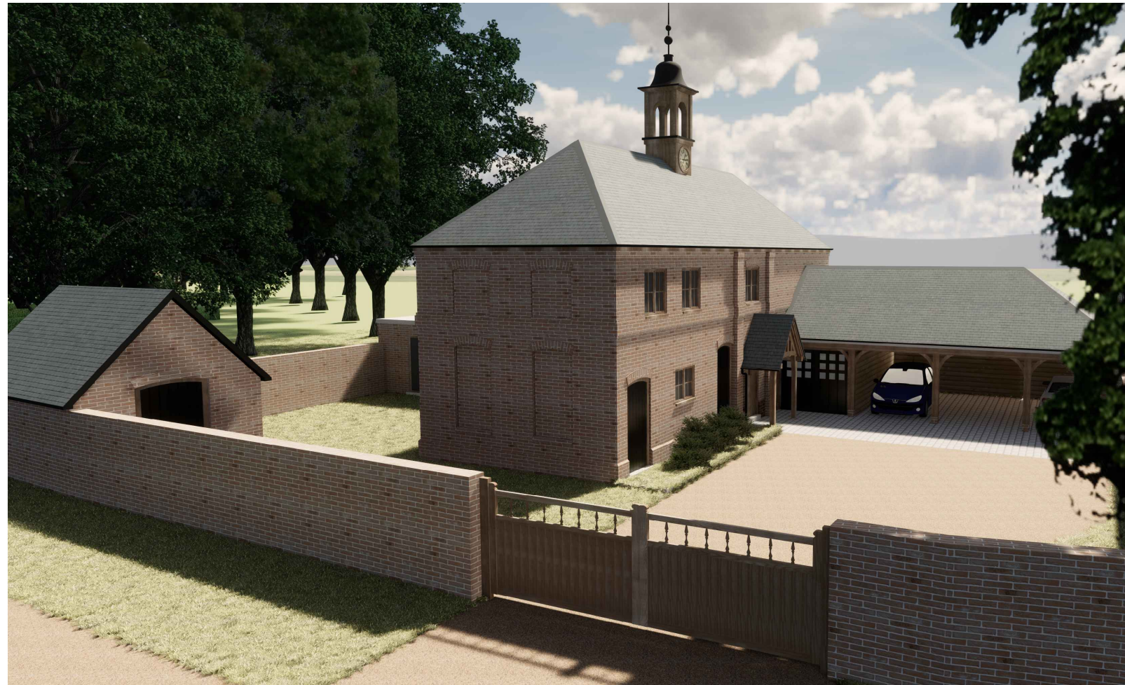
PROPOSED FRONT 3D VIEW, STABLE BLOCK