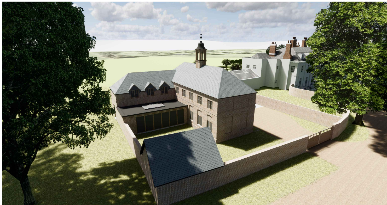
PROPOSED FRONT AERIAL VIEW, STABLE BLOCK