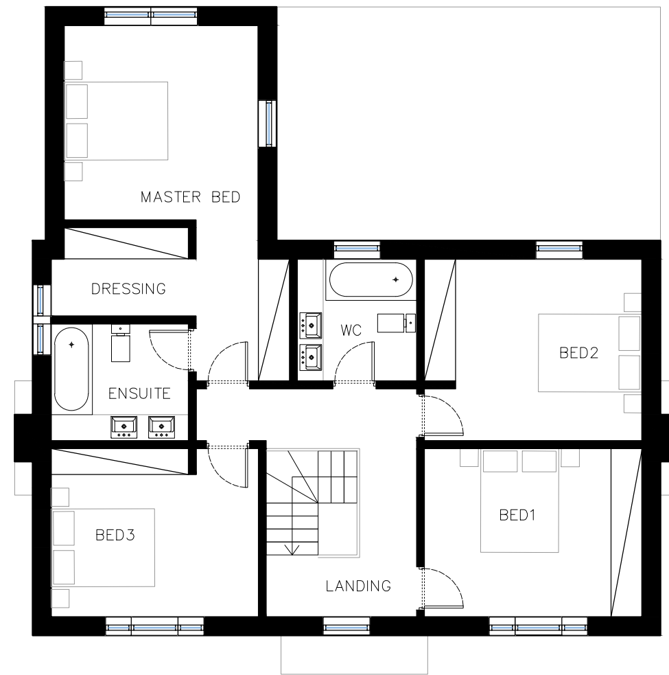
PROPOSED FIRST FLOOR, FARM HOUSE 1:100