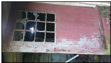
3. Yard doors to be preserved and re located in front of the original position