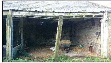
2. Cart House to be reconstructed