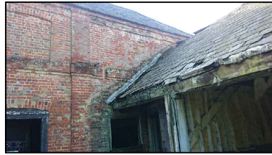
2. Cart House to be reconstructed