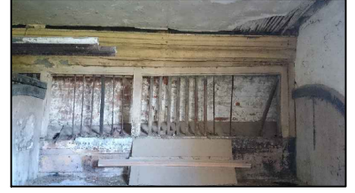
6. Retained moulding feature