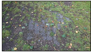
1. Diamond Paviors