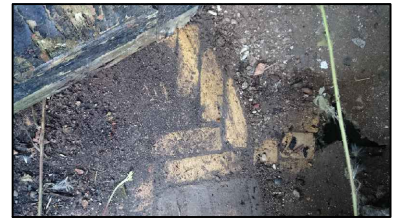
4. Retained flooring