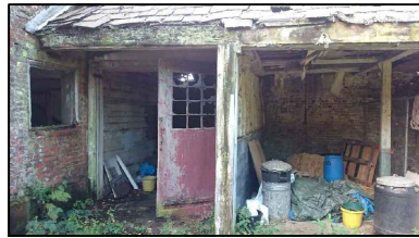
2. Cart House to be reconstructed