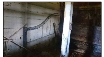
8. Retained stall