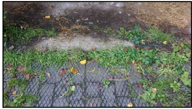
1. Diamond Paviors