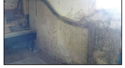
5. Retained stall