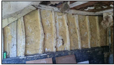
2. Cart House to be reconstructed