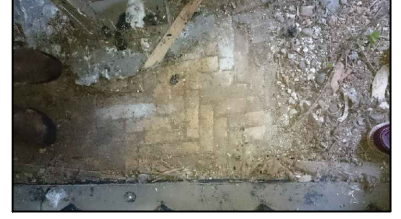
4. Retained flooring