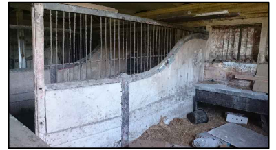
7. Retained stall