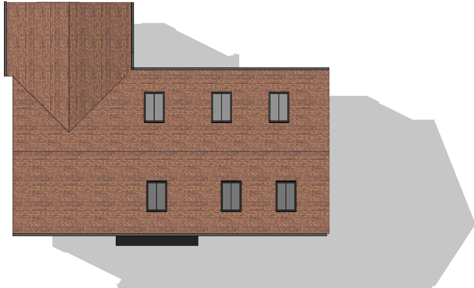
PROPOSED ROOF PLAN, SETTLEMENT UNIT 1