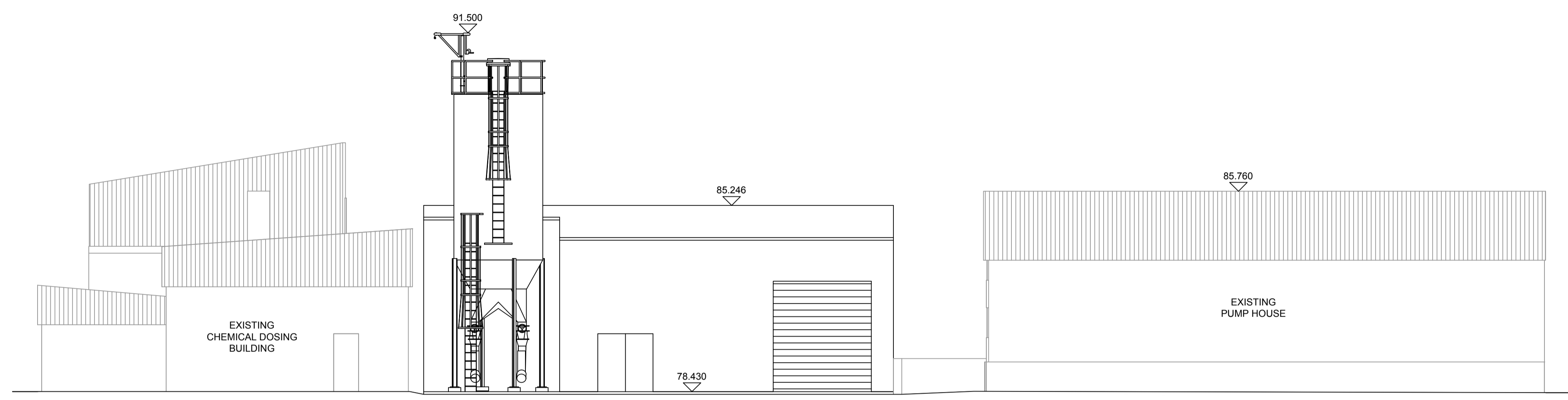
NORTH ELEVATION SCALE 1:100

REFERENCE DRAWINGS: P018849-SK-326-0002 - PROPOSED SITE LAYOUT P018849-SK-326-0006 - ISOMETRIC VIEWS P018849-SK-326-0007 - PLANNING ELEVATIONS SHEET 1 OF 2