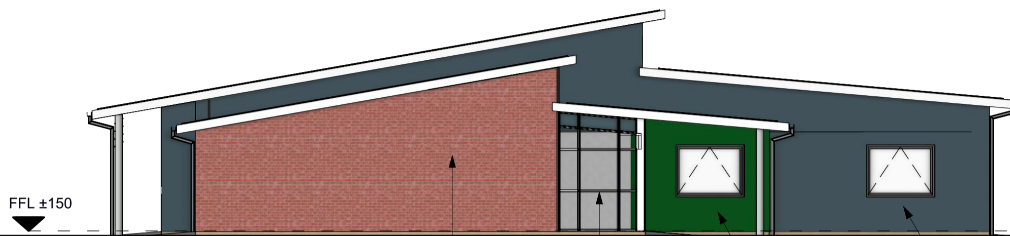
C North East Elevation

Existing Sixth Form/ Technology Block Render 2 colour ref tbc Weatherboarding Curtain wall Render 1 colour ref tbc Render 2 colour ref tbc Brick 1 Brick 2