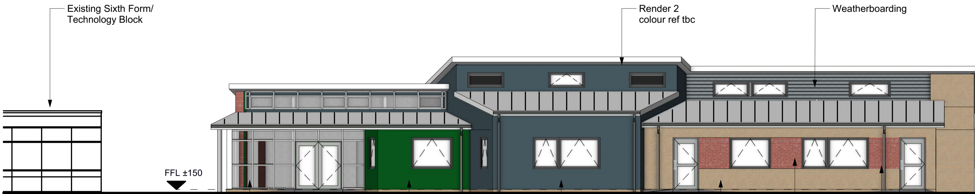
B North West Elevation

Existing Sixth Form/ Technology Block Render 2 colour ref tbc Weatherboarding Curtain wall Render 1 colour ref tbc Render 2 colour ref tbc Brick 1 Brick 2