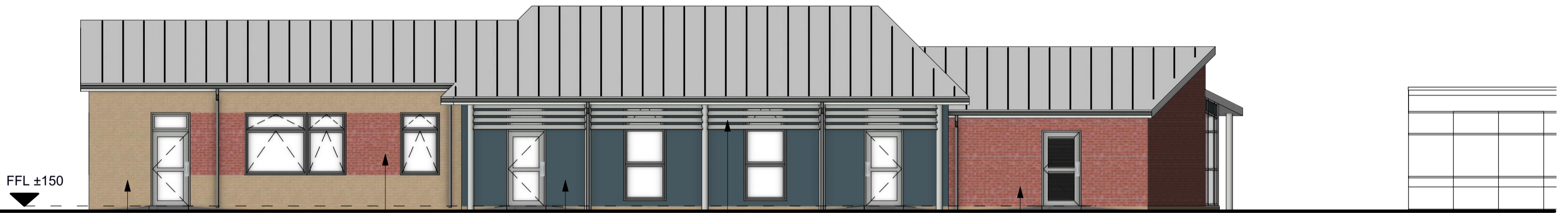
D South East Elevation

Brick 2 Curtain wall Render 1 colour ref tbc Render 2 colour ref tbc