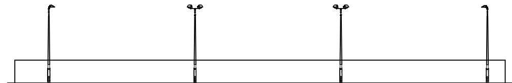
BB TRAVERSE SECTION SCALE: 1:500