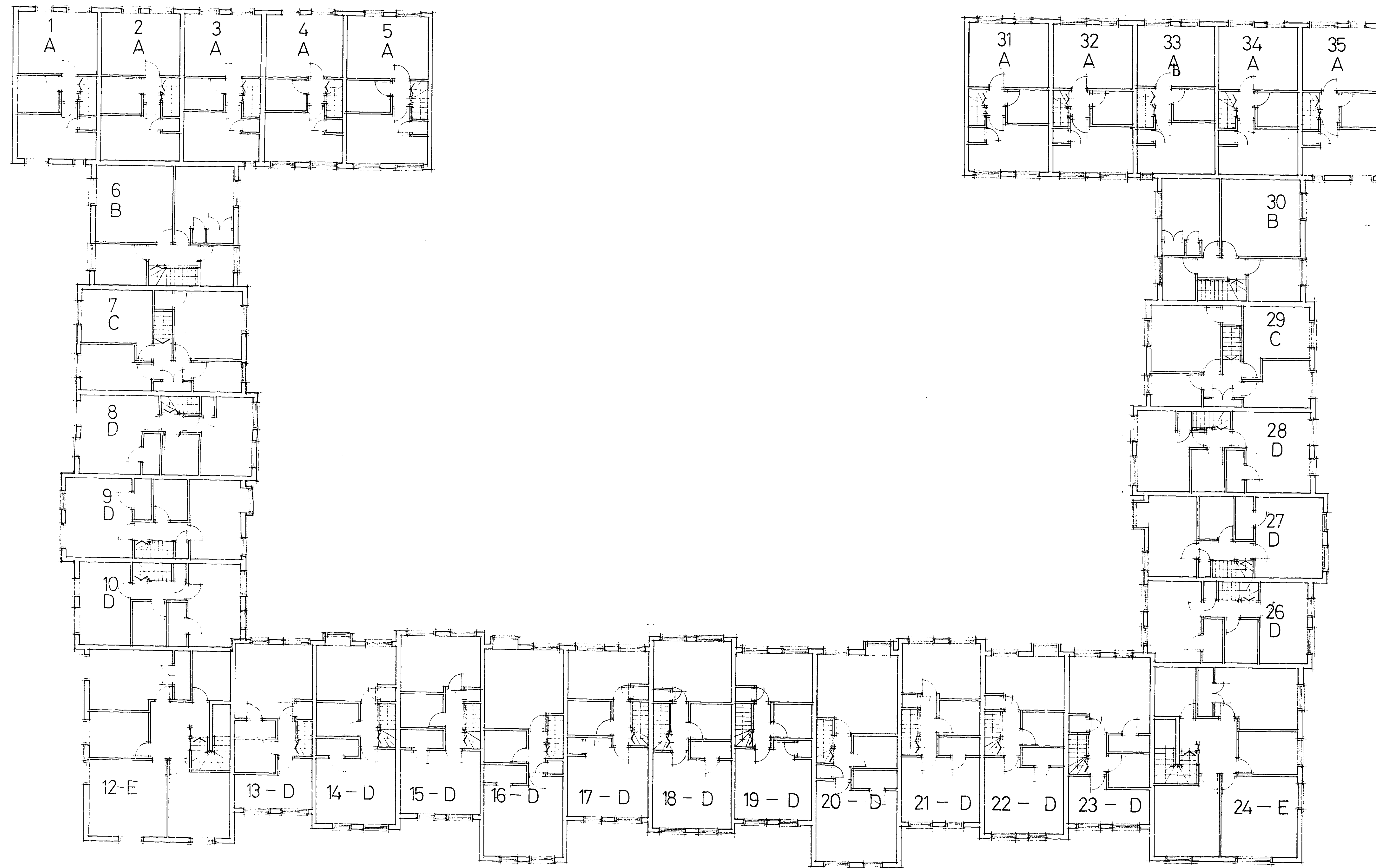
First Floor Layout.