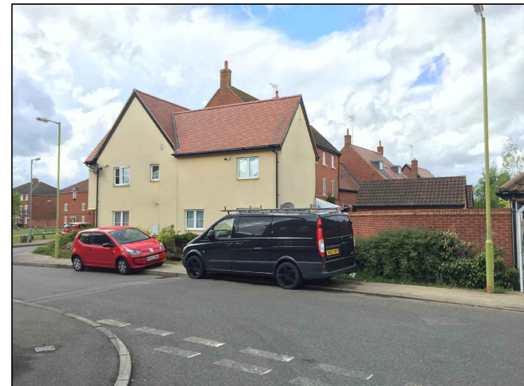
SIDE VIEW OF NO. 2