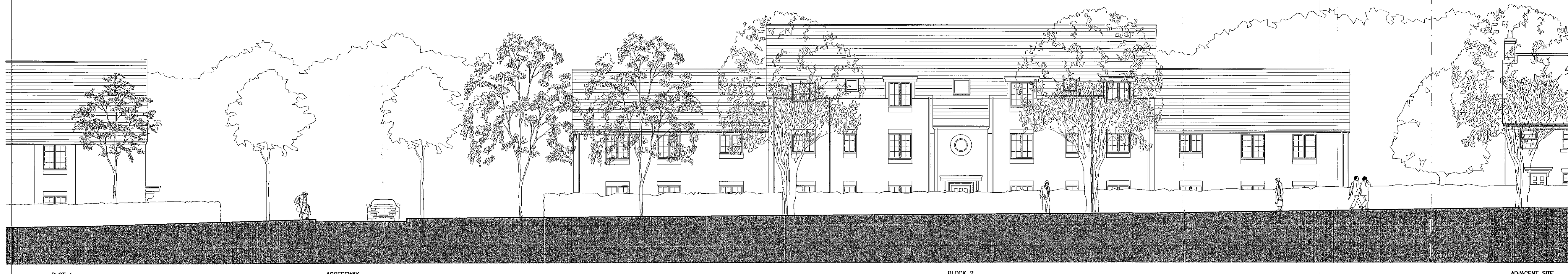
STREET ELEVATION 1:100