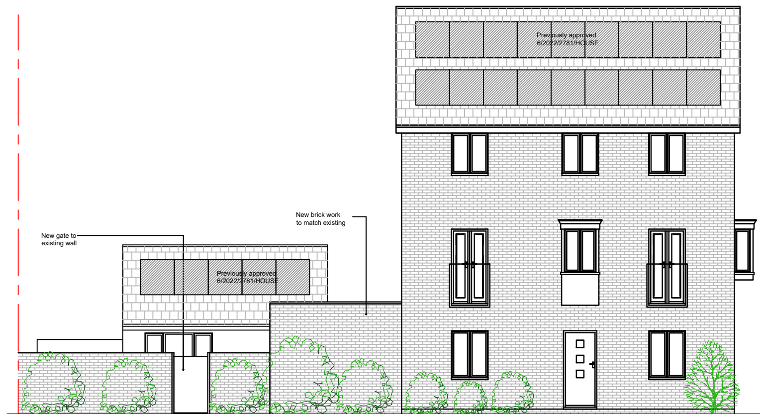
Front Elevation Proposed ST JOSEPHS GREEN