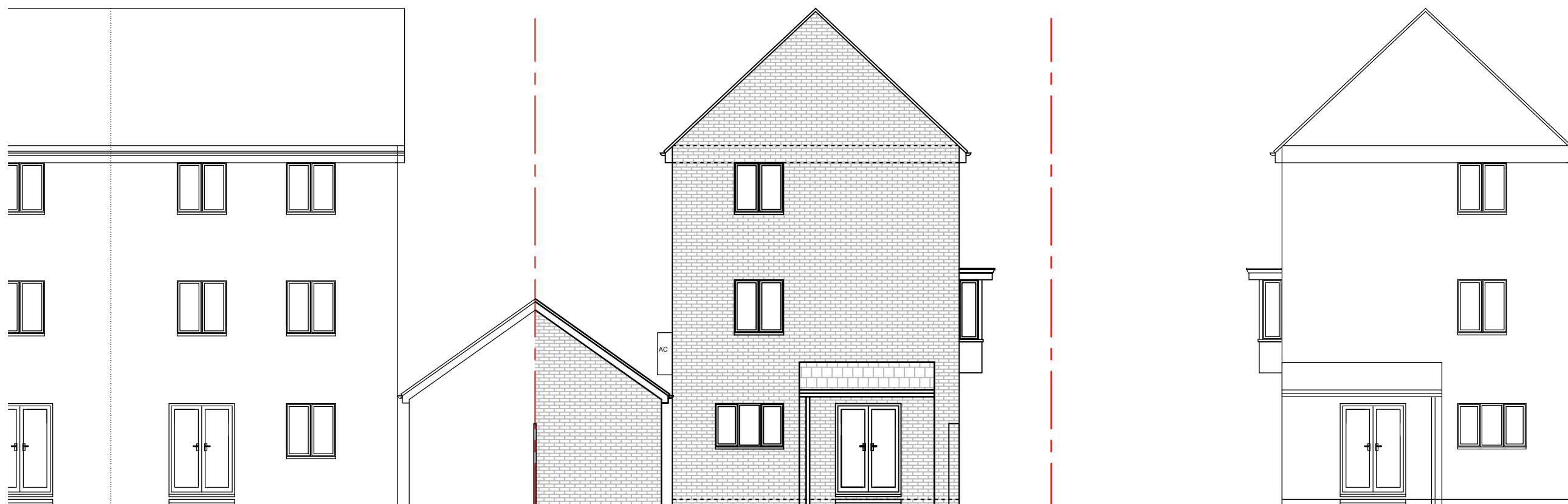
Side 2 Elevation Existing