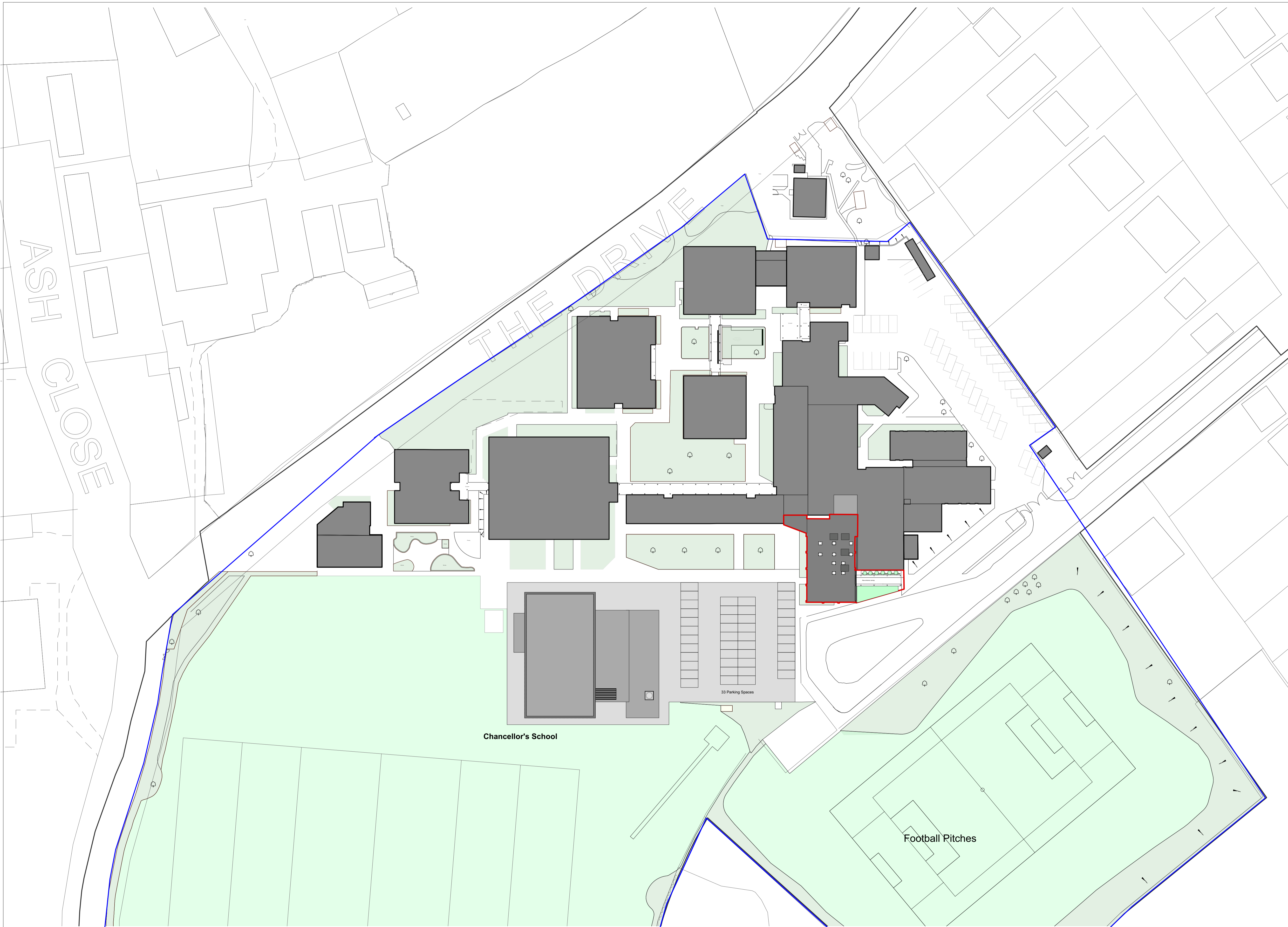
Proposed Site Plan Scale 1:500

NOTES: All other design team elements, where indicated, have been imported from the consultant's drawings and reference should be made to the individual consultant's drawings for exact setting out, size and type of component. Discrepancies and / or ambiguities within this drawing, between it and the information give elsewhere, must be reported immediately to the architect for clarification before proceeding. All works are to be carried out in accordance with the latest British Standards and Codes of Practice unless specifically directed otherwise in the specification. Responsibility for the reproduction of this drawing in paper form, or if issued in electronic format, lies with the recipient to check that all information has been replicated in full and is correct when compared to the original paper or electronic image. Graphical representations of equipment on this drawing have been co-ordinated, but are approximations only. Please refer to the Specifications and / or Details for actual sizes and / or specific contractor construction information.