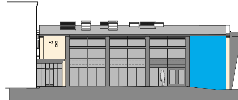
PROPOSED WEST ELEVATION - 1:200