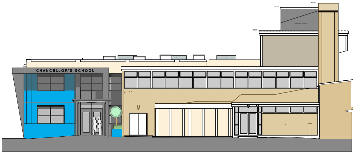
PROPOSED EAST ELEVATION - 1:200