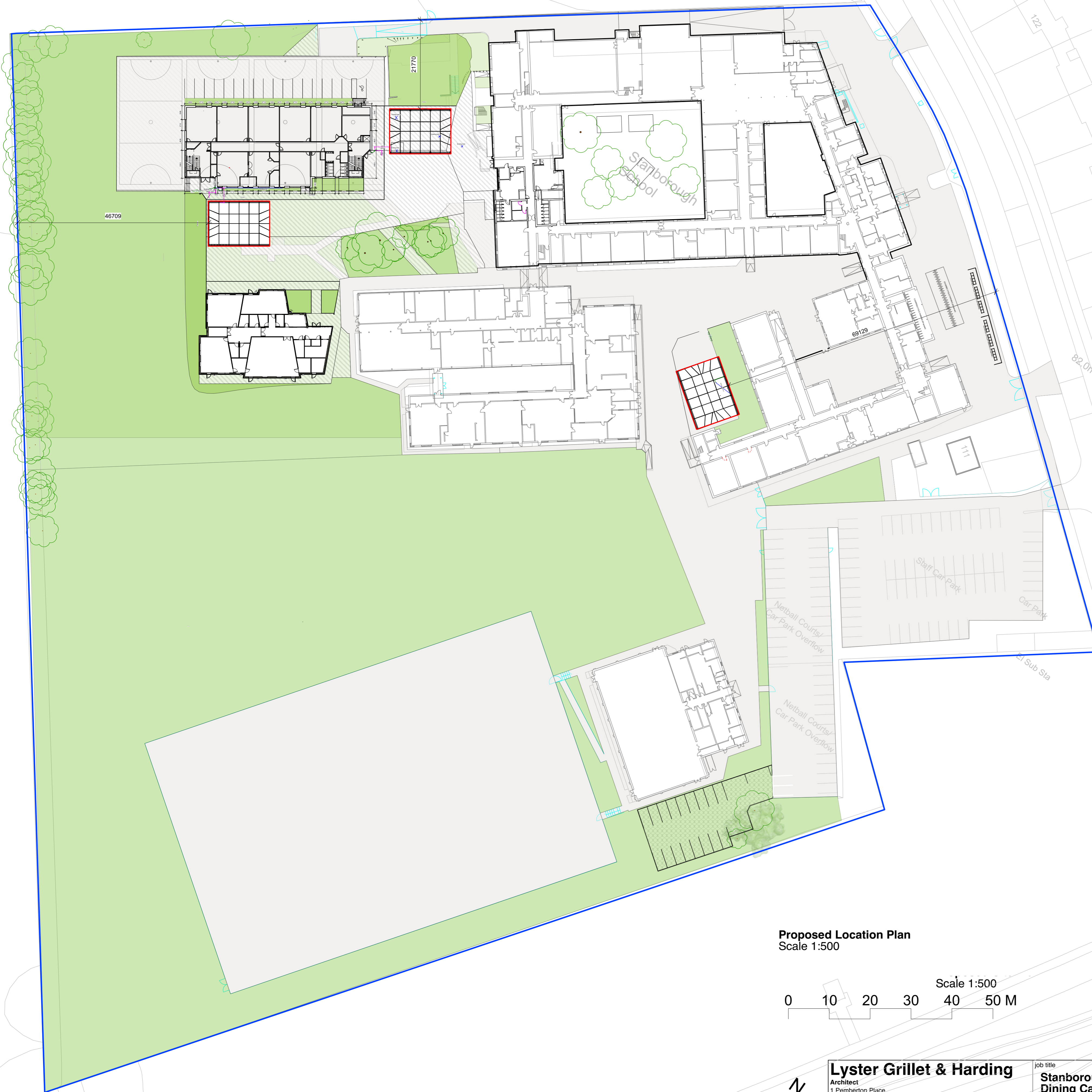
Proposed Location Plan Scale 1:500