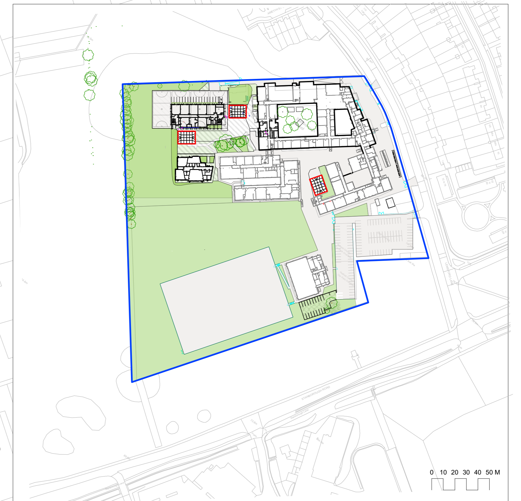
Proposed Location Plan Scale 1:2000 Included to illustrate greater surrounding area outside of site.