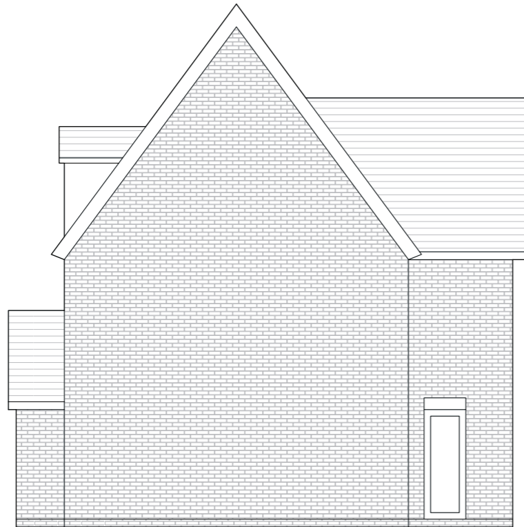
○ SIDE ELEVATION 2, EXISTING SCALE 1:100