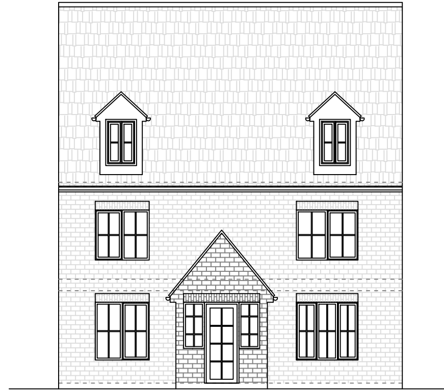
14 PROPOSED FRONT ELEVATION SCALE 1:100