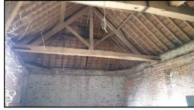
9. Roof structure

✓ Intention to retain all historic decorative work (joinery, plasterwork, fire surrounds, etc) and to provide new matching features as necessary.