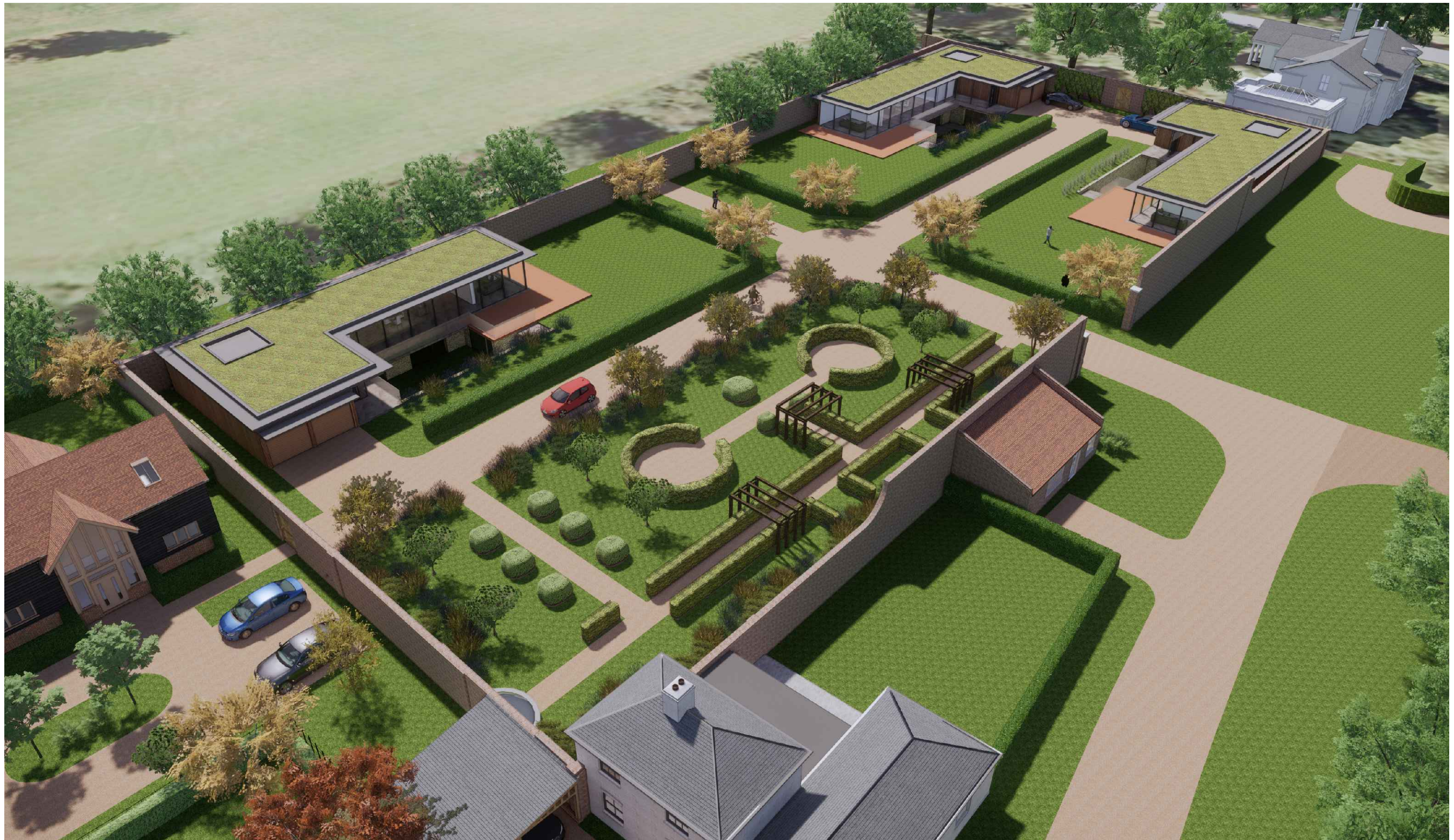
PROPOSED AERIAL VIEW, WALLED GARDEN