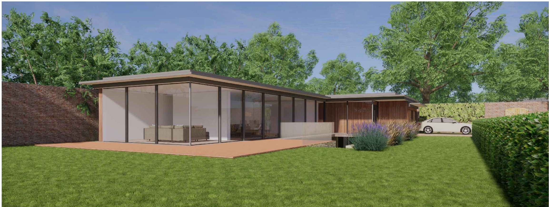
PROPOSED GARDEN 3D VIEW, WALLED GARDEN