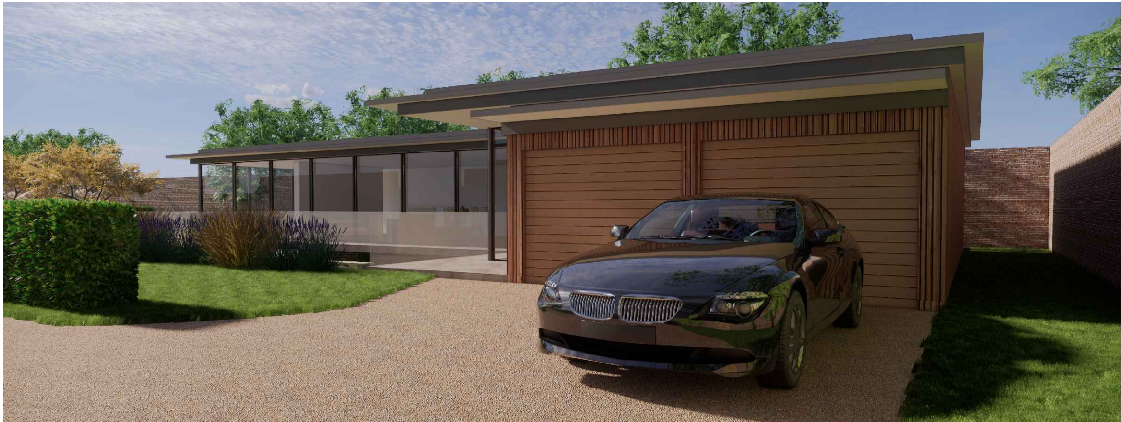
PROPOSED FRONT 3D VIEW, WALLED GARDEN