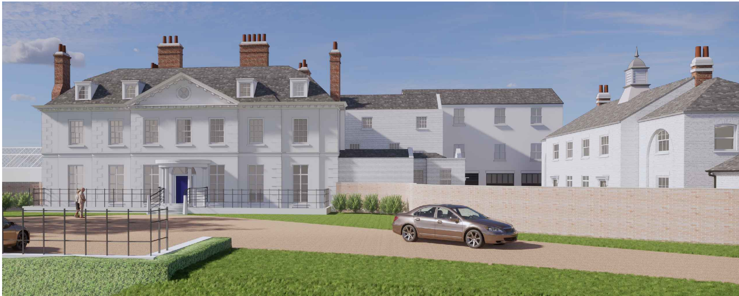
PROPOSED FRONT 3D VIEW, NORTHAW HOUSE