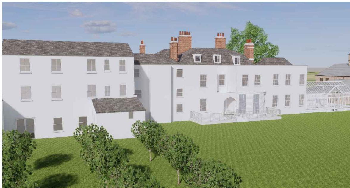
PROPOSED BACK 3D VIEW, NORTHAW HOUSE