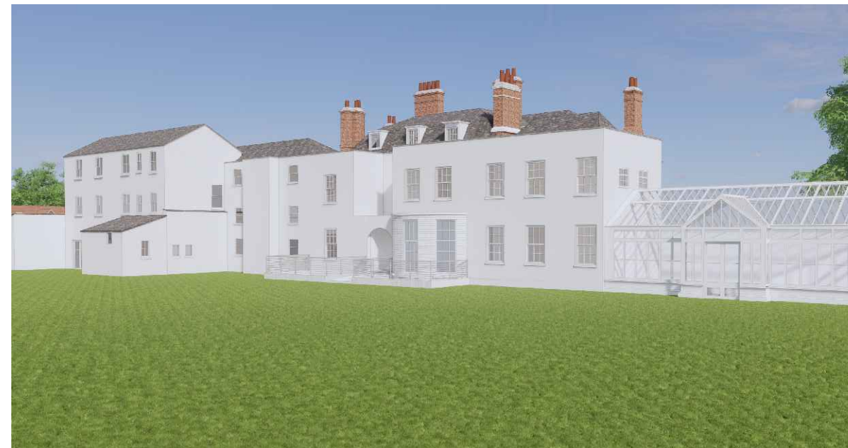
PROPOSED BACK 3D VIEW 2, NORTHAW HOUSE