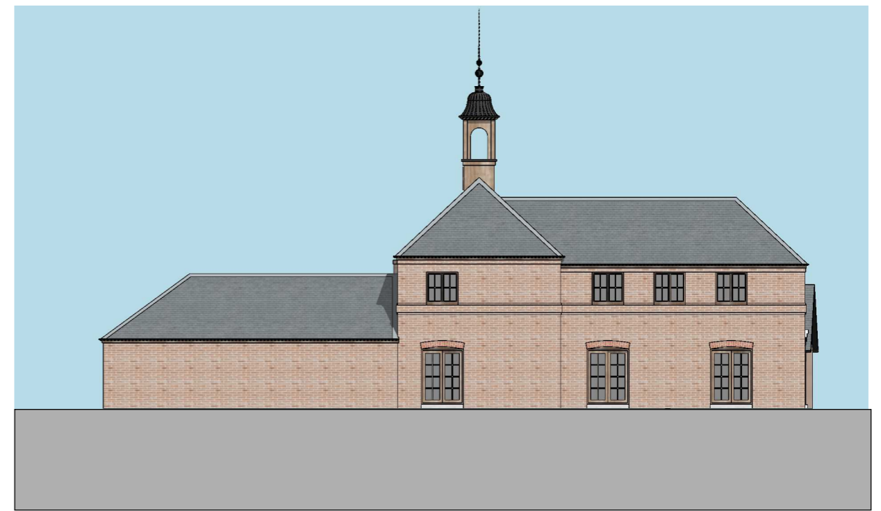
PROPOSED SOUTH ELEVATION, STABLE BLOCK