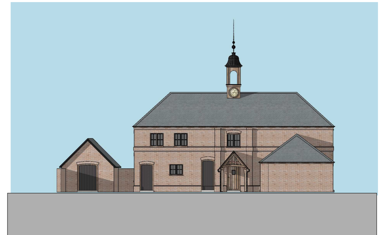
PROPOSED WEST ELEVATION, STABLE BLOCK