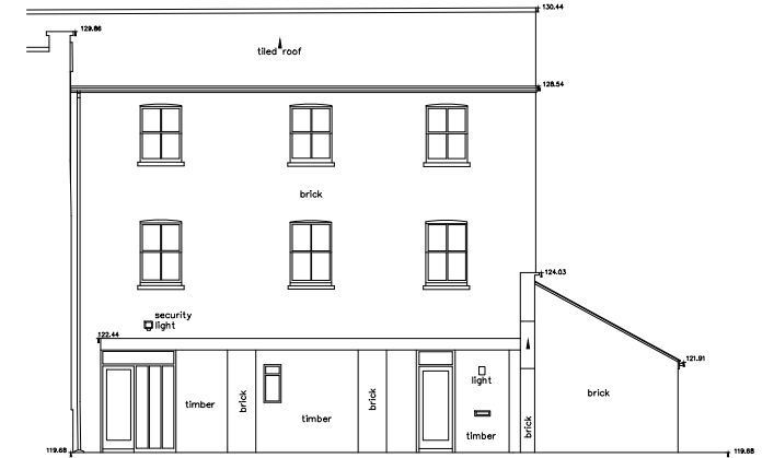
EXISTING NORTH RETURN ELEVATION (C), NORTHAW HOUSE 1:200