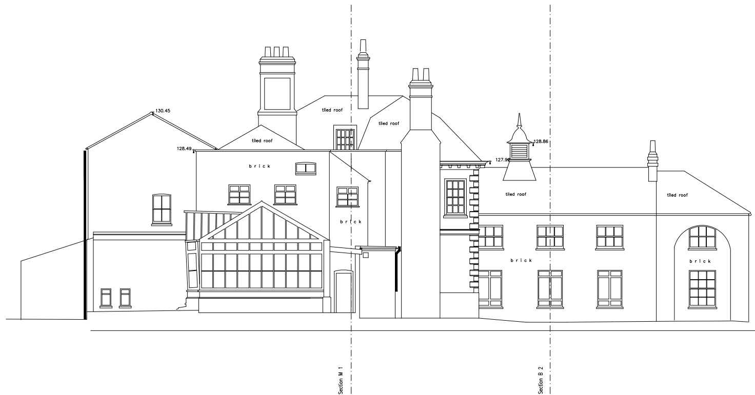
EXISTING EAST ELEVATION (D), NORTHAW HOUSE 1:200