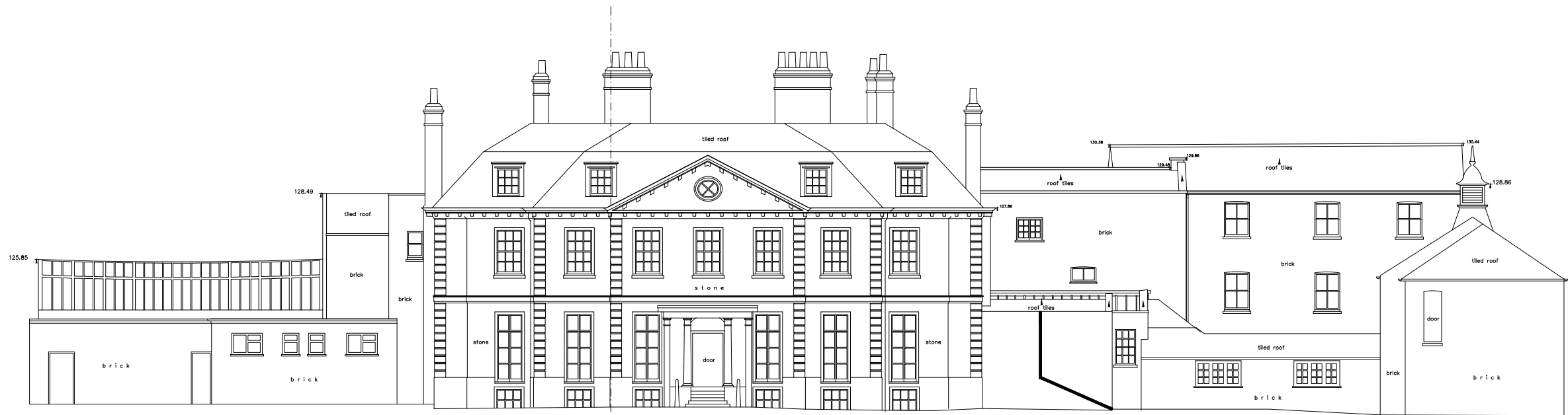
EXISTING NORTH ELEVATION, NORTHAW HOUSE AND EDWARDIAN WING 1:200