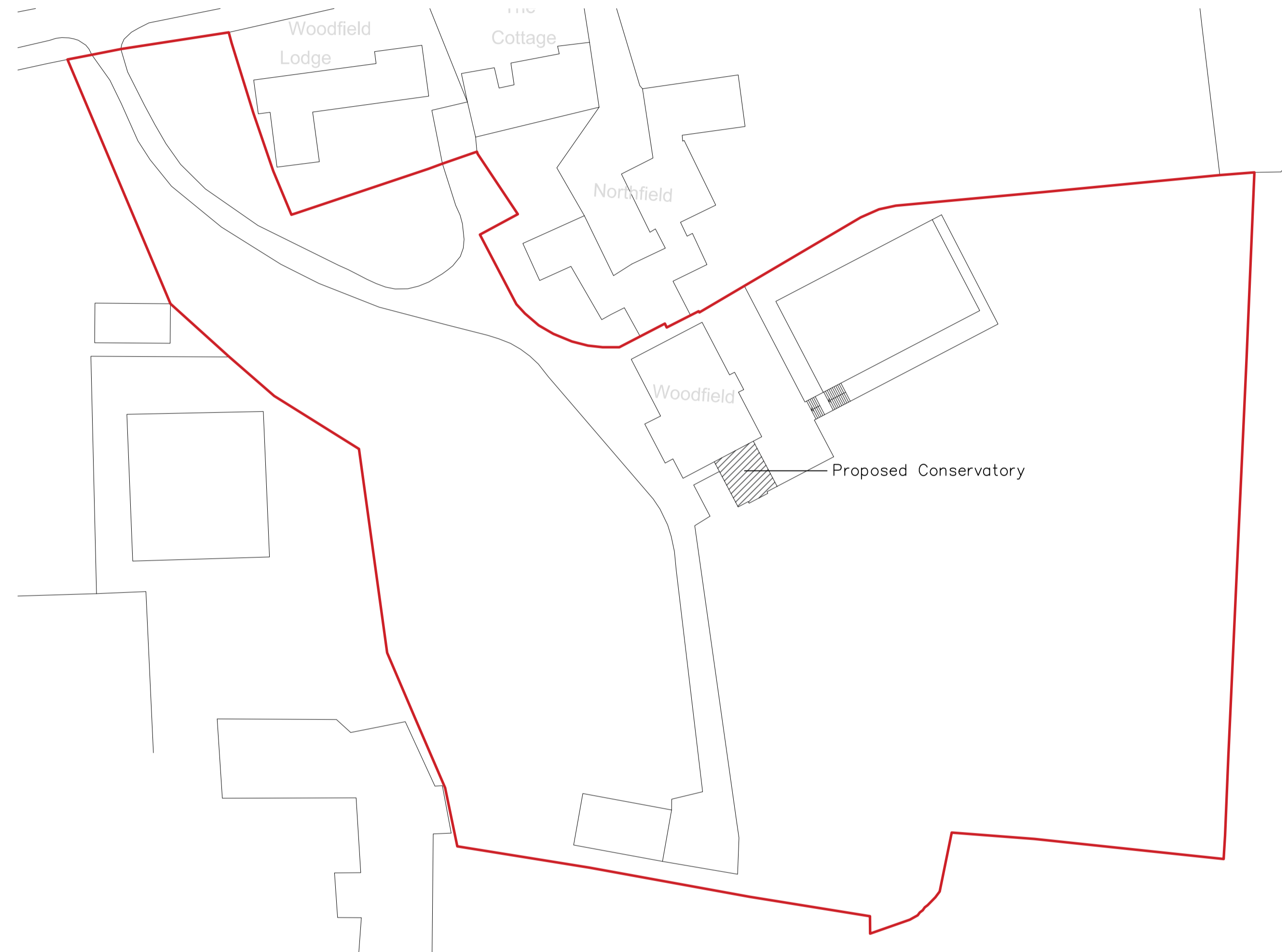
Site / Block Plan 1:500