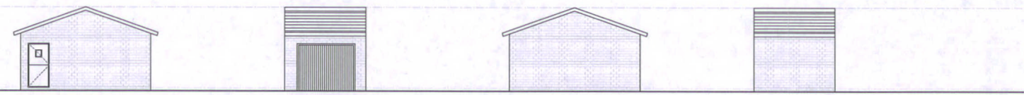
SIDE ELEVATION FRONT ELEVATION SIDE ELEVATION REAR ELEVATION