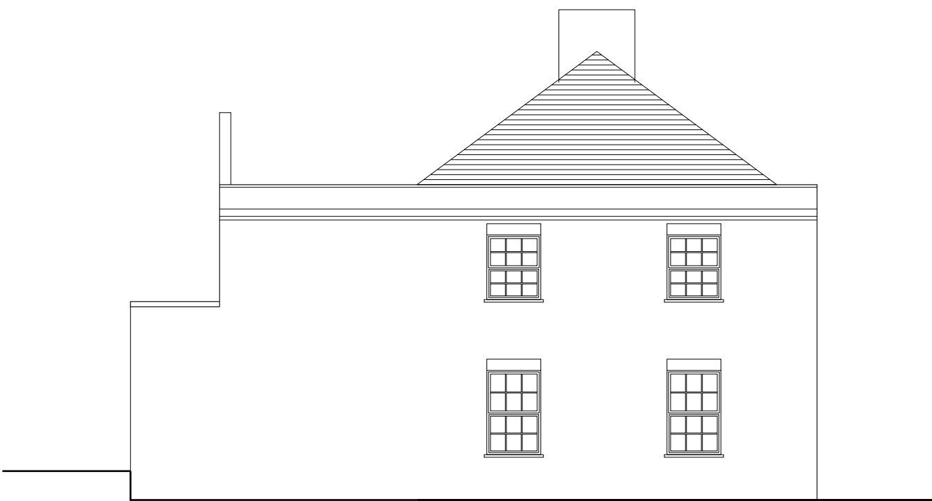
4 | EXISTING SIDE 2 ELEVATION SK-001 | SCALE@A1 1:50 SCALE@A3 1:100