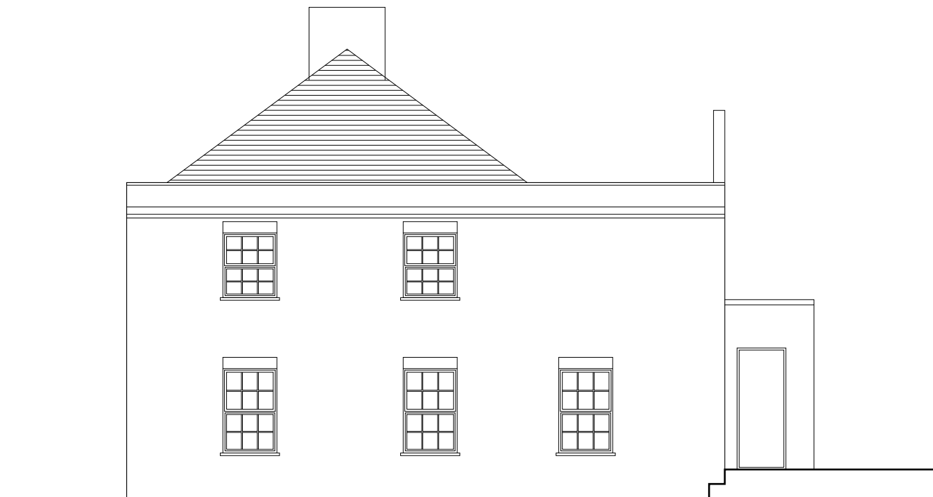
2 | EXISTING SIDE 1 ELEVATION SK-001 | SCALE@A1 1:50 SCALE@A3 1:100