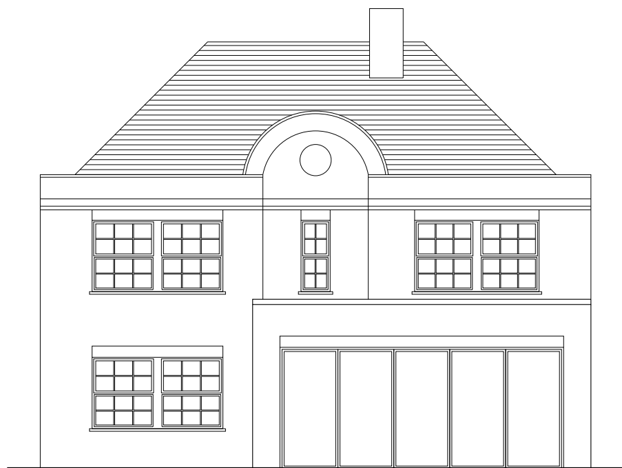
3 | EXISTING REAR ELEVATION SK-001 | SCALE@A1 1:50 SCALE@A3 1:100