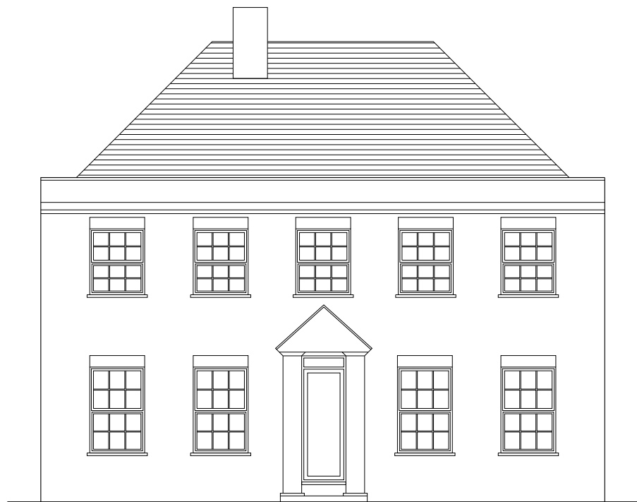
1 | EXISTING FRONT ELEVATION SK-001 | SCALE@A1 1:50 SCALE@A3 1:100