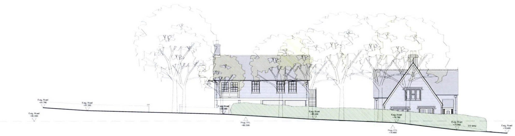
① North Elevation Scale: 1:250