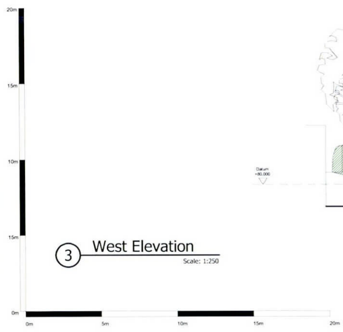
③ West Elevation Scale: 1:250