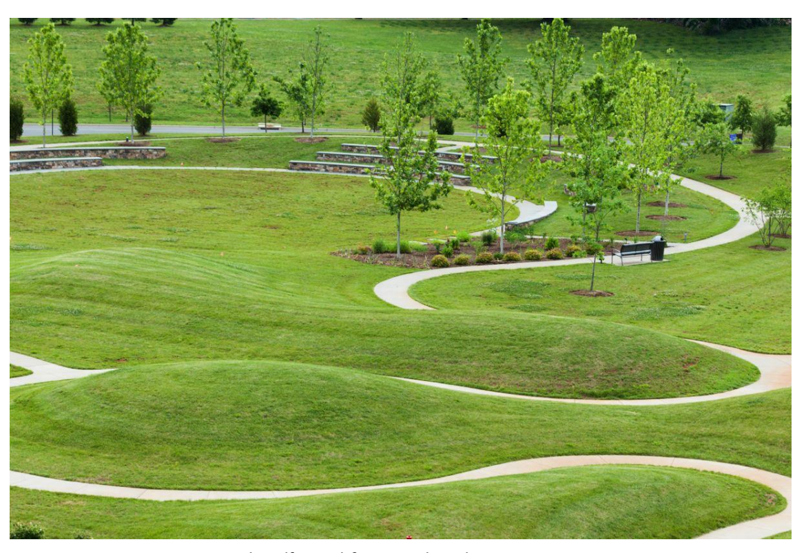
Landformed & grassed outdoor space