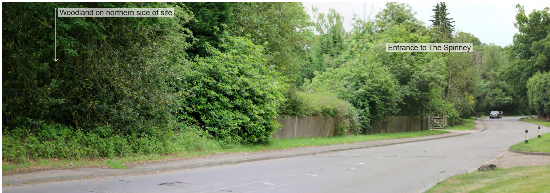
Photograph J View looking south towards site from High Road (opposite Essendon Manor entrance)

Scarp landscape architecture environmental planning