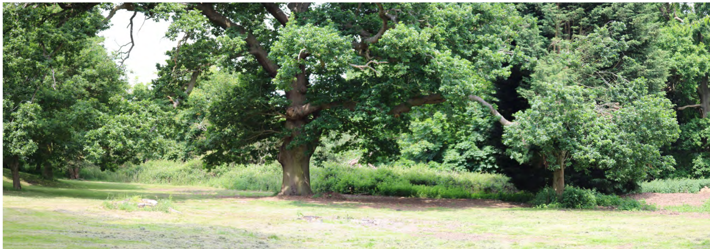
Photograph F View looking west towards site from golf course

Scarp landscape architecture environmental planning