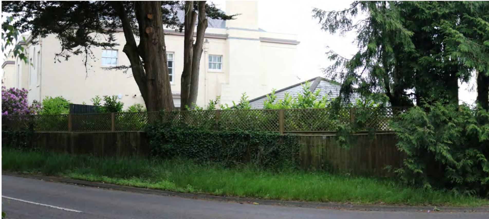
Photograph I View of building towards Dimsdale House on western side of High Road