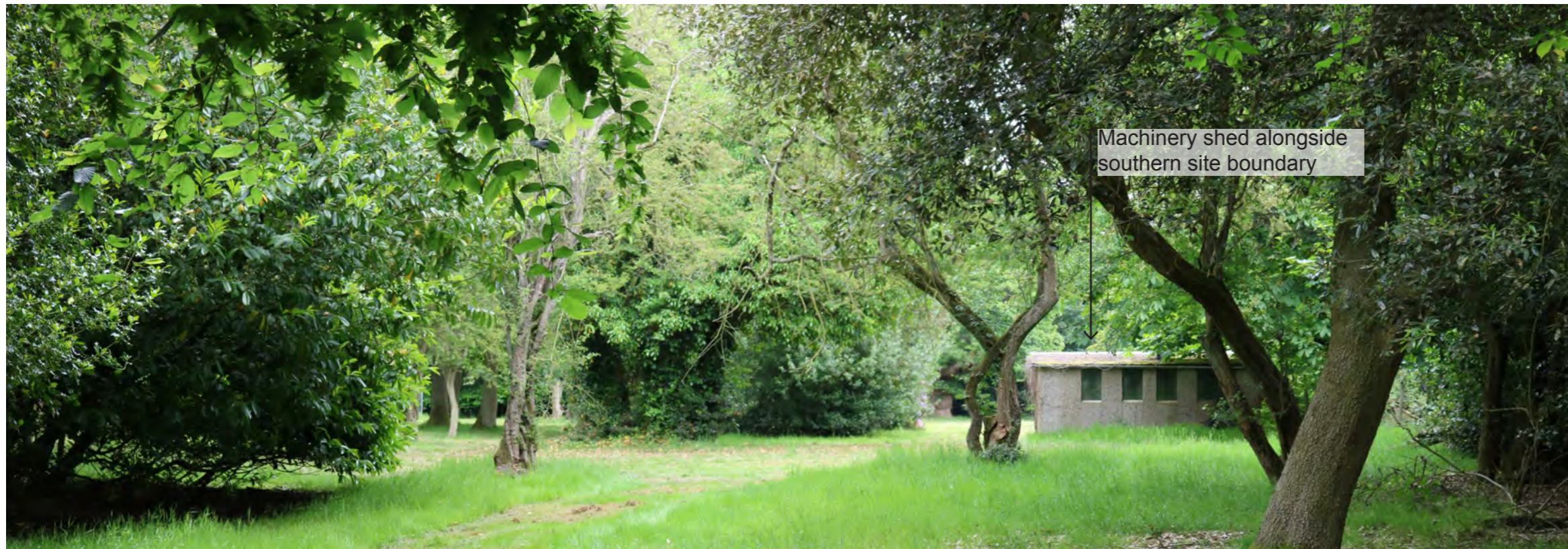
Machinery shed alongside southern site boundary