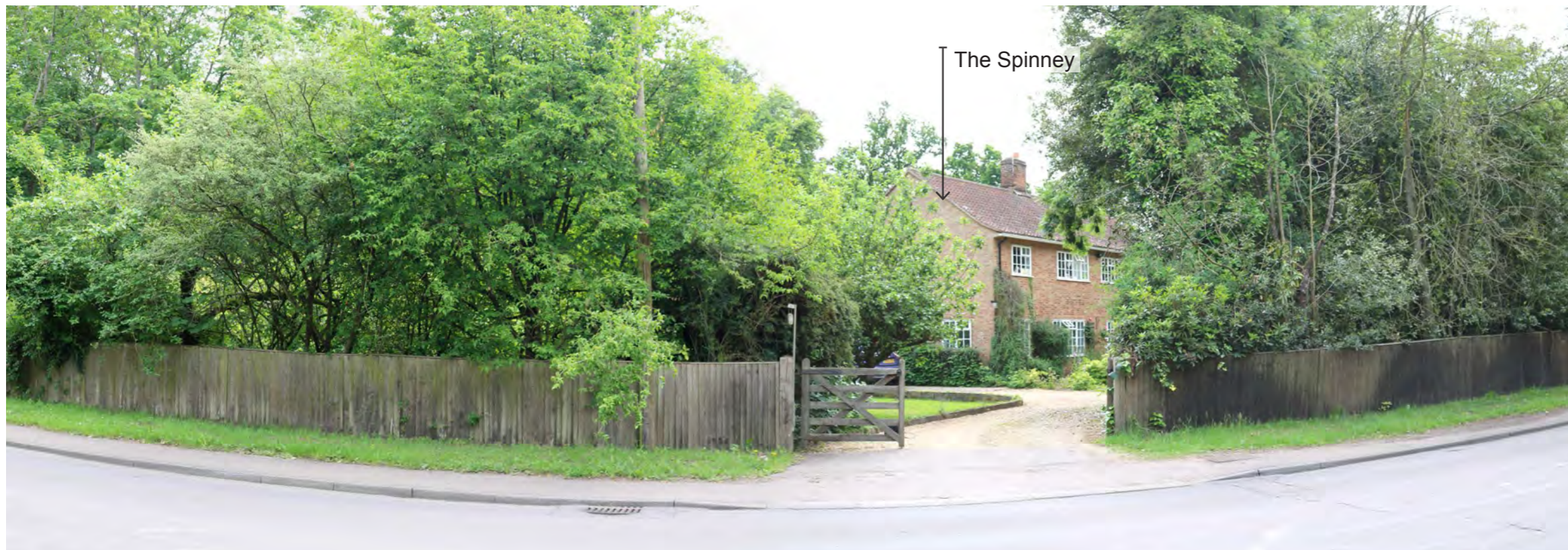
Photograph L View looking southeast into site through site entrance

Scarp landscape architecture environmental planning