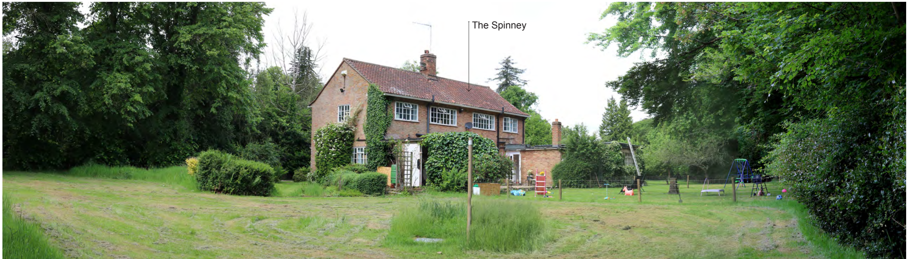
Photograph A View looking north towards northern corner of site