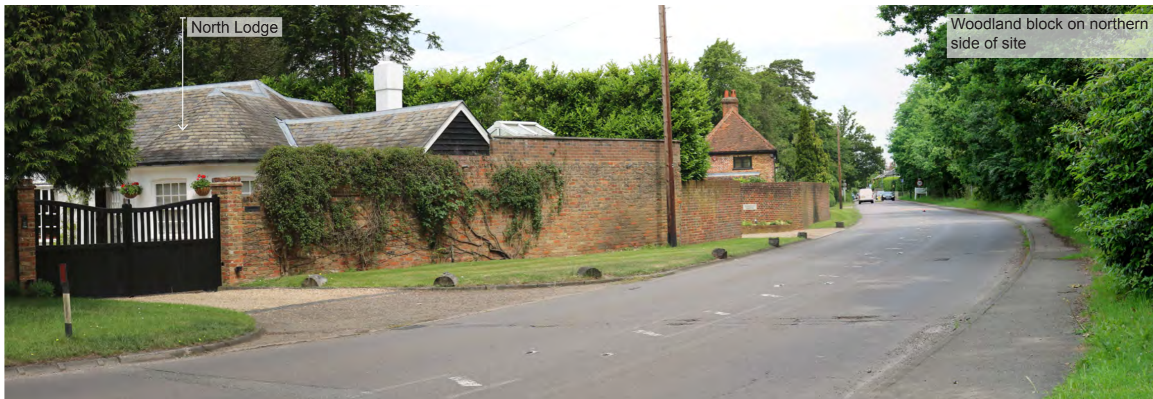
Photograph H View looking towards southern edge of Essendon

Scarp landscape architecture environmental planning