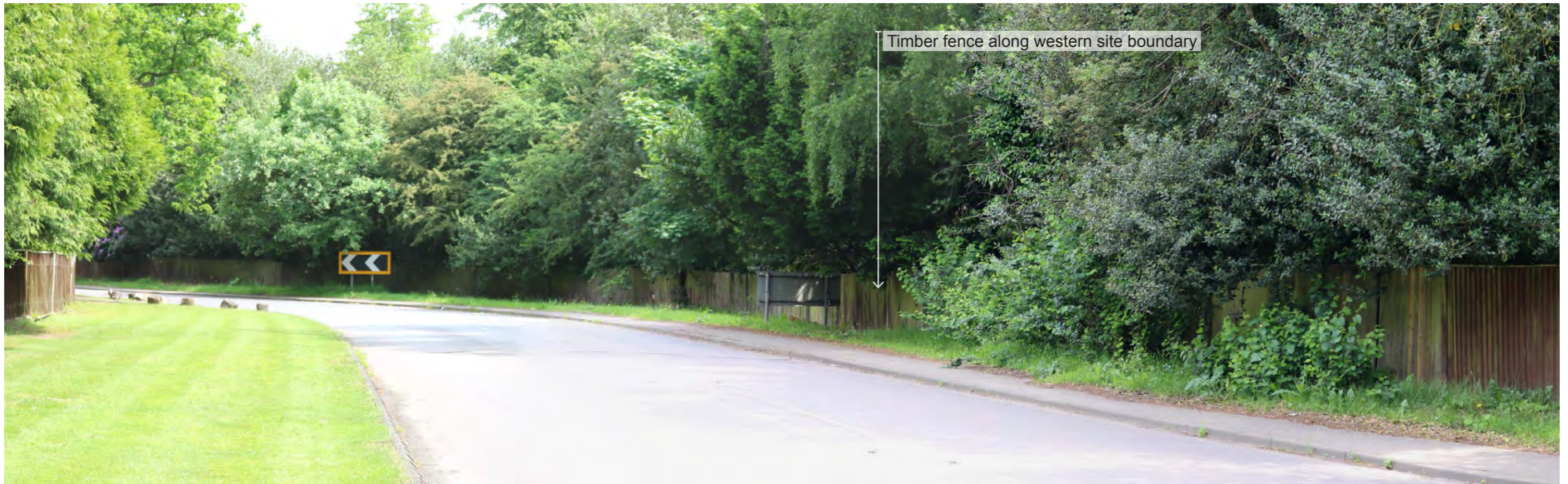
Photograph M View looking northeast towards site from High Road