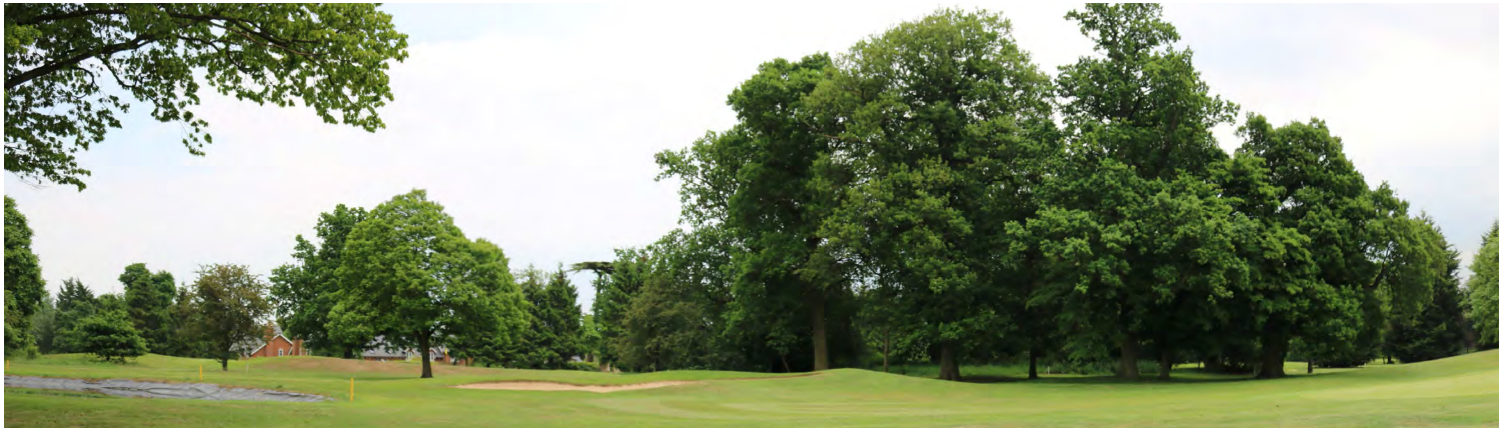
Photograph G View looking southeast across golf course