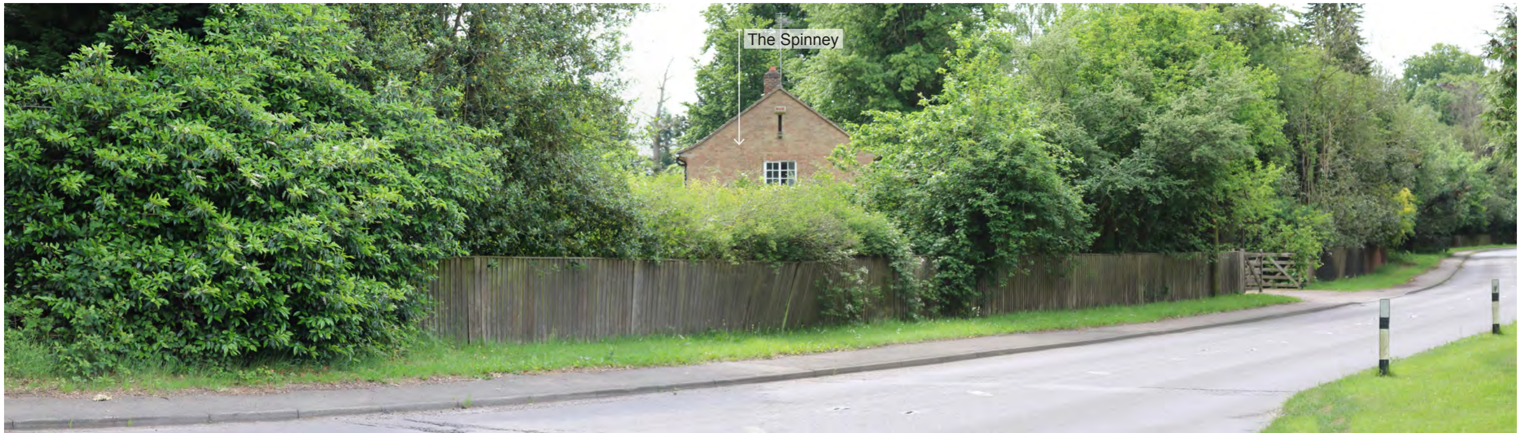
Photograph K View looking southeast towards site from High Road (opposite site entrance)