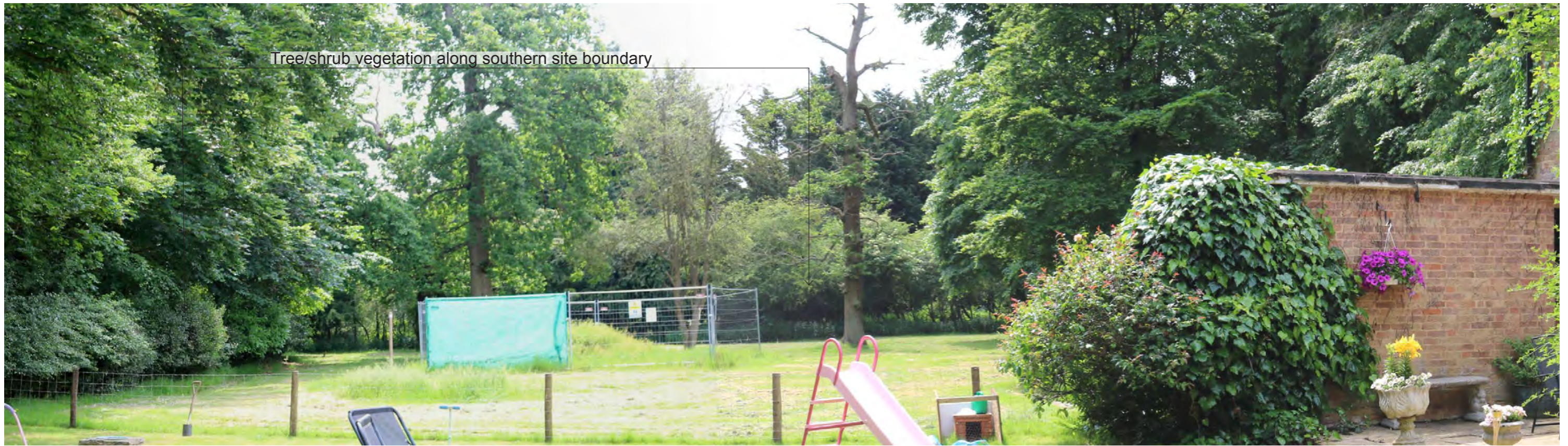
Tree/shrub vegetation along southern site boundary