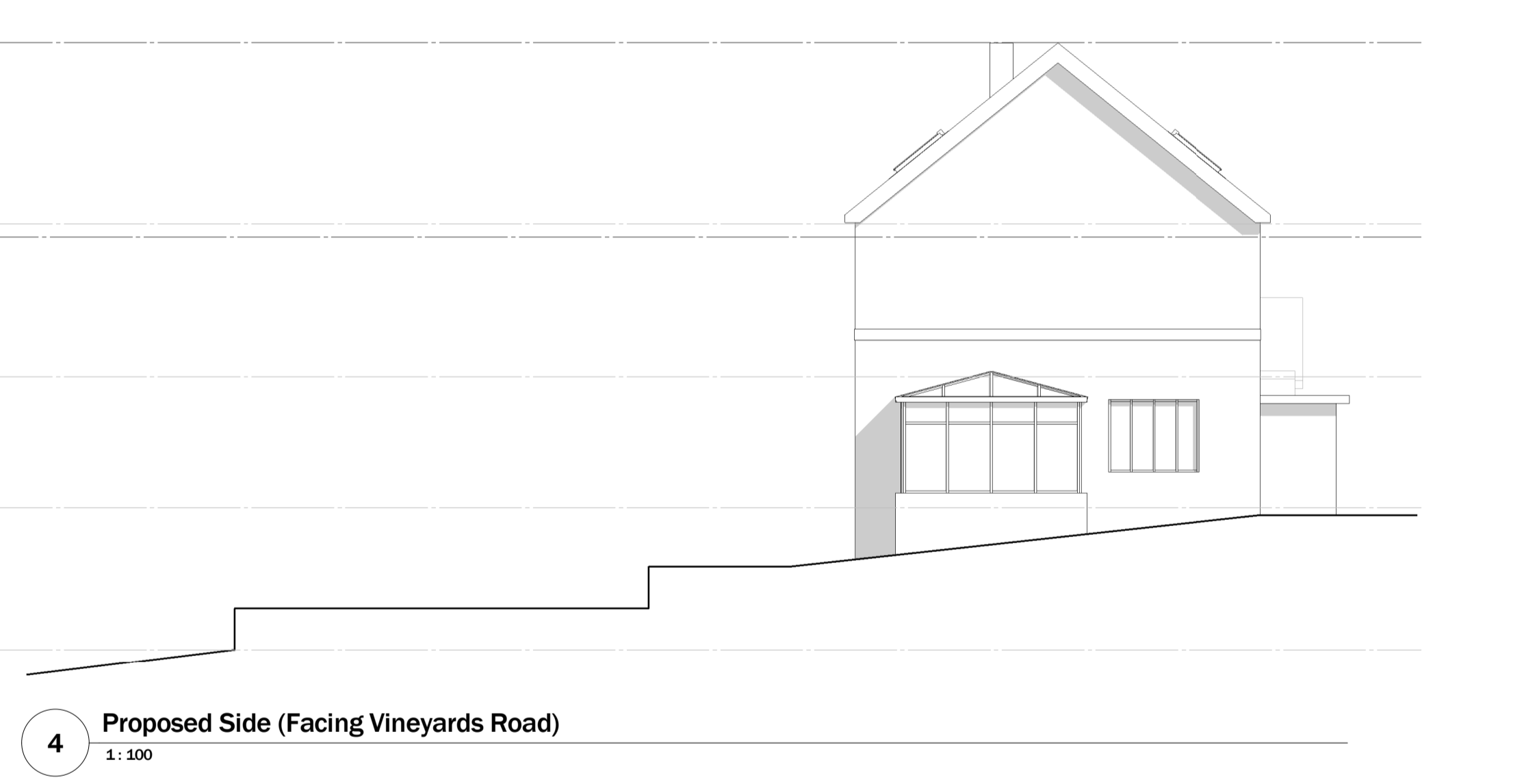
4 Proposed Side (Facing Vineyards Road) 1:100