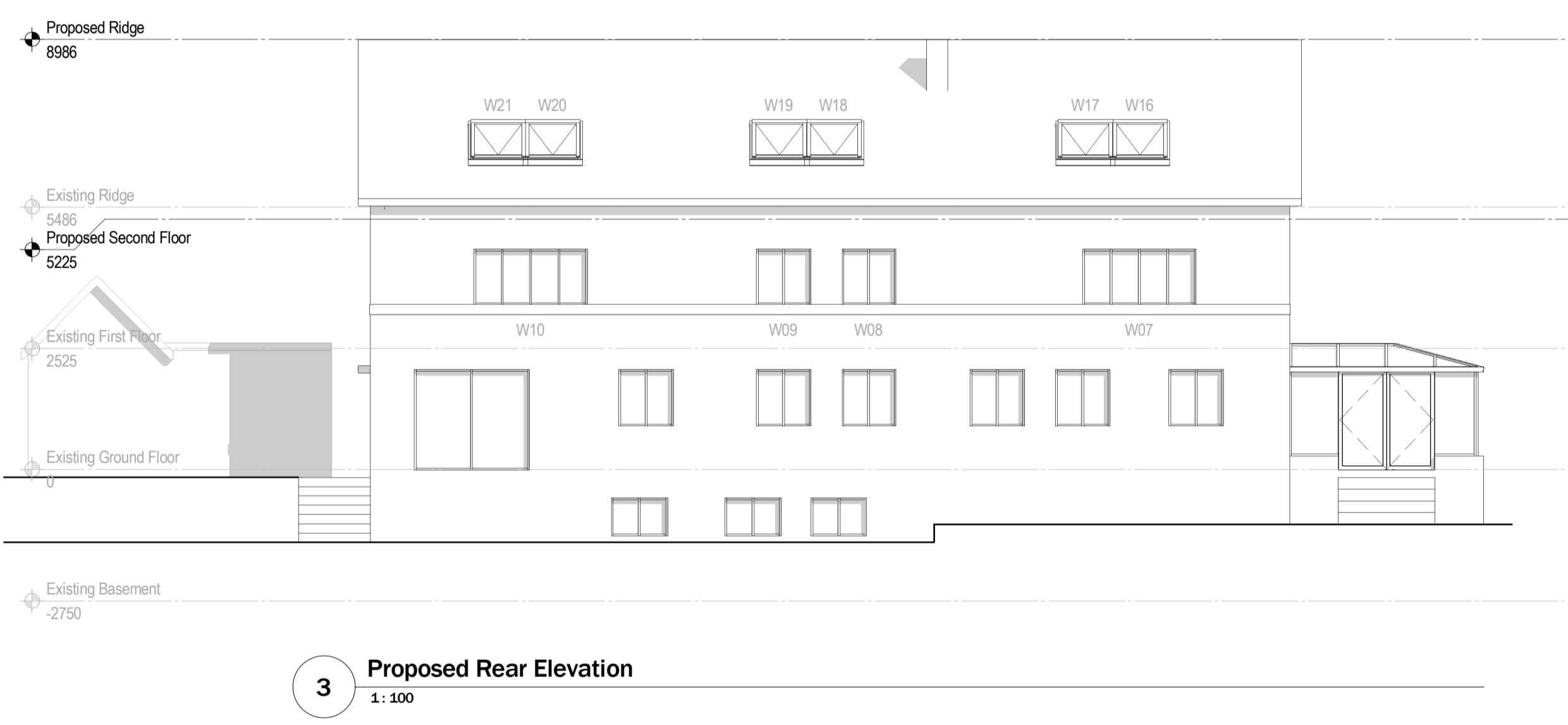
3 Proposed Rear Elevation 1:100