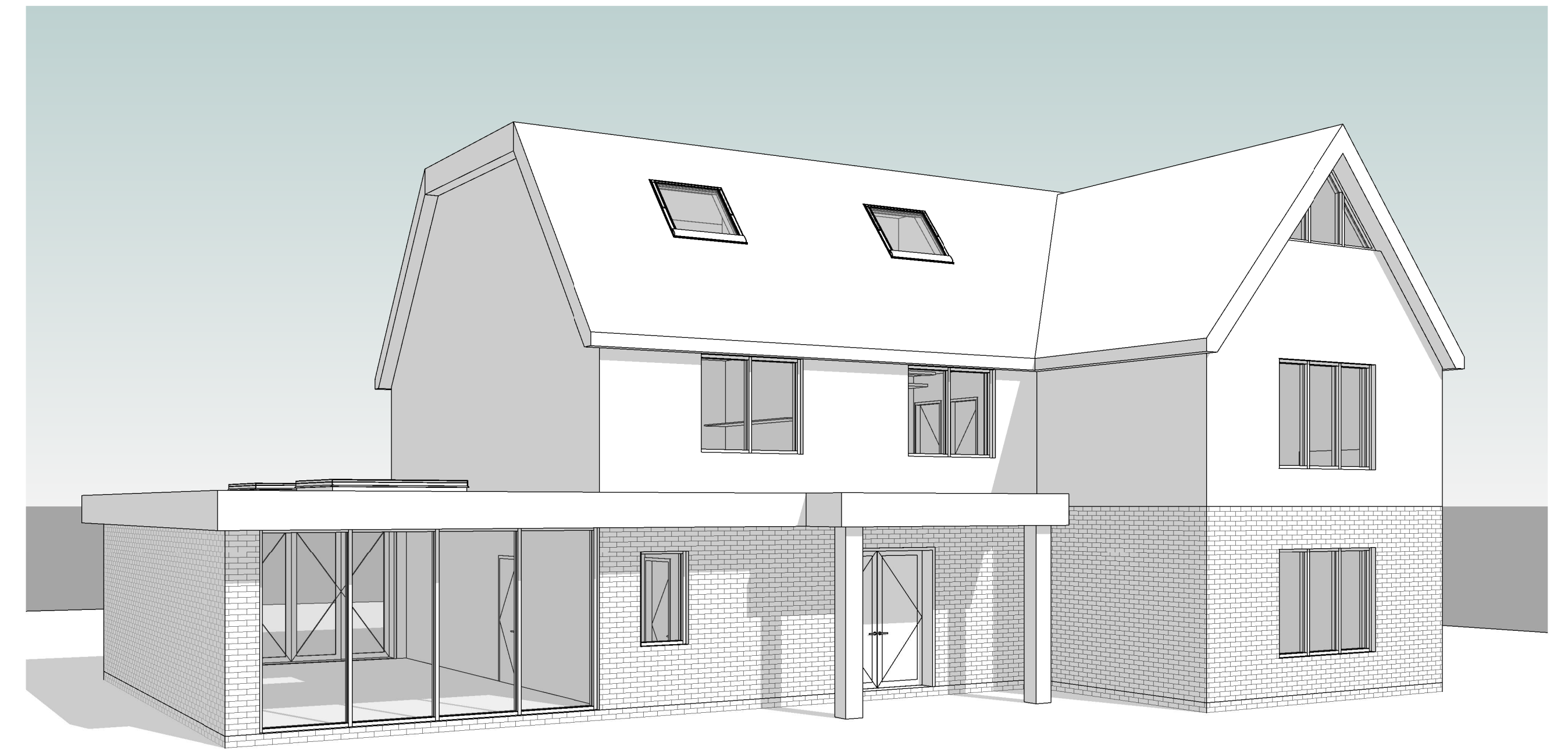
2 3D View 2

PLEASE NOTE: - This drawing is for the purpose of design development ONLY and is NOT FOR CONSTRUCTION unless stated otherwise. - Do not scale. - Any construction details are indicative only and should not be used for setting out. - Confirmation of sizes must be performed onsite prior to manufacture or construction of items using these dimensions. - © Copyright Technical Detail Ltd 2020