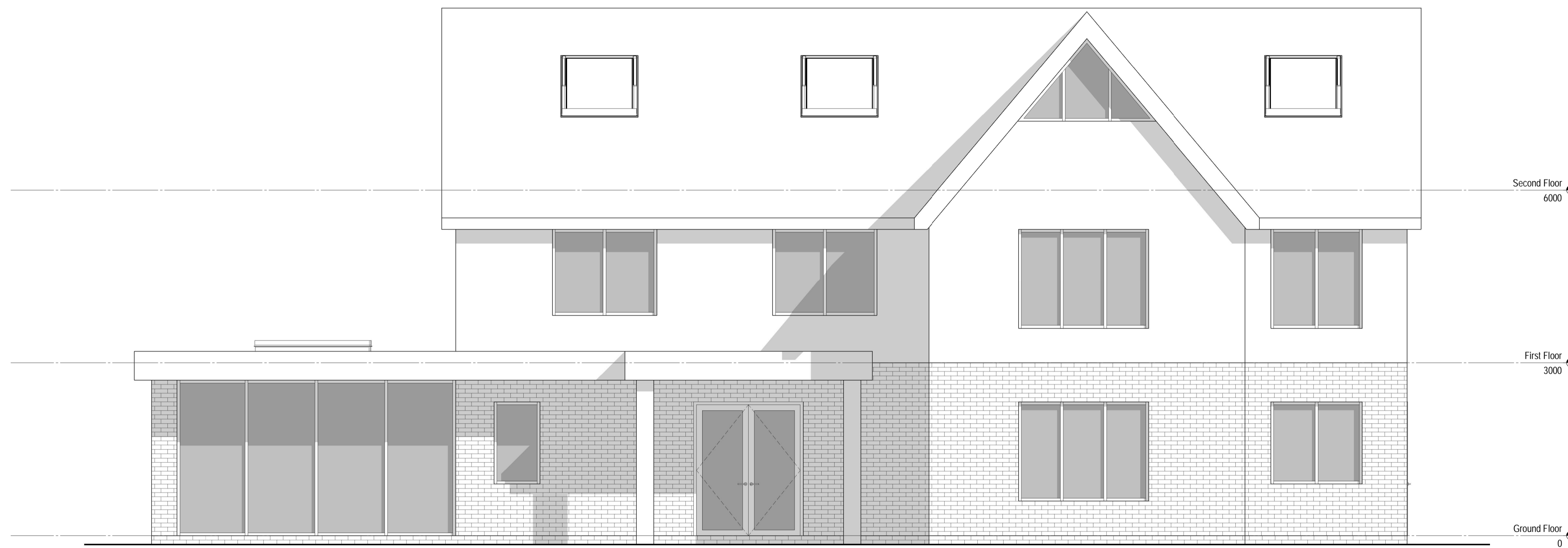
1 Proposed Front Elevation 1:50