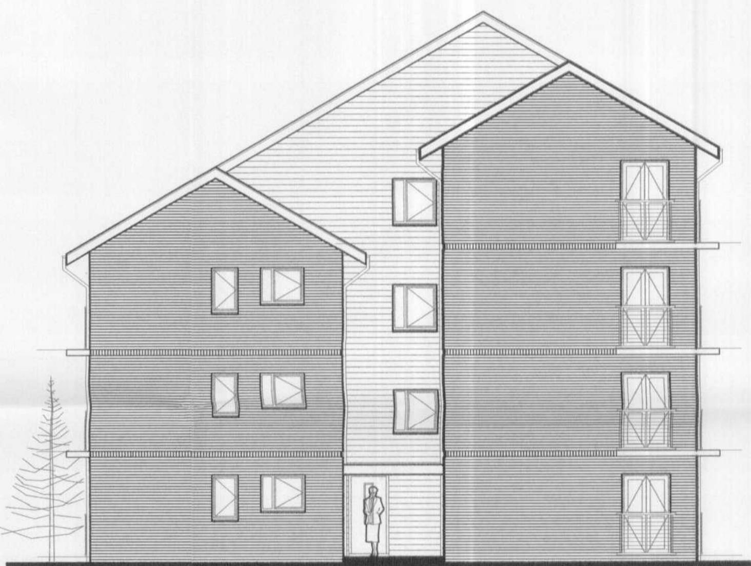
SOCIAL VARIANT - TYPICAL SIDE ELEVATION

EXTERNAL FINISHES ELEVATIONS: Ibstock Hardwicke Welbeck Red Mixture wirecut Ibstock Staffordshire Slate Blue smooth (ground floor elevations to feature units) White Eternit timber-type Weatherboard (circulation elements / recessed features) ROOF: Eternit Birkdale dark grey tile WINDOWS: PVCu White BRISES SOLEIL: PPC White Aluminium fascia / Natural Aluminium Blades BALCONIES: PPC White Balusters / Rails GMS Safety Backing Mesh EXTERNAL DOORS: Timber gloss white