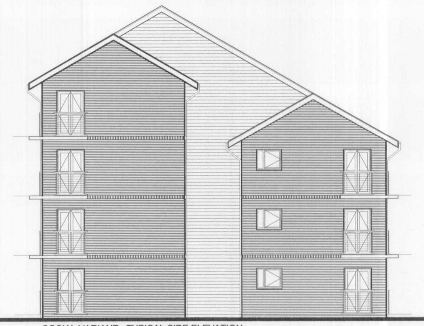
SOCIAL VARIANT - TYPICAL SIDE ELEVATION UNIT 68-78