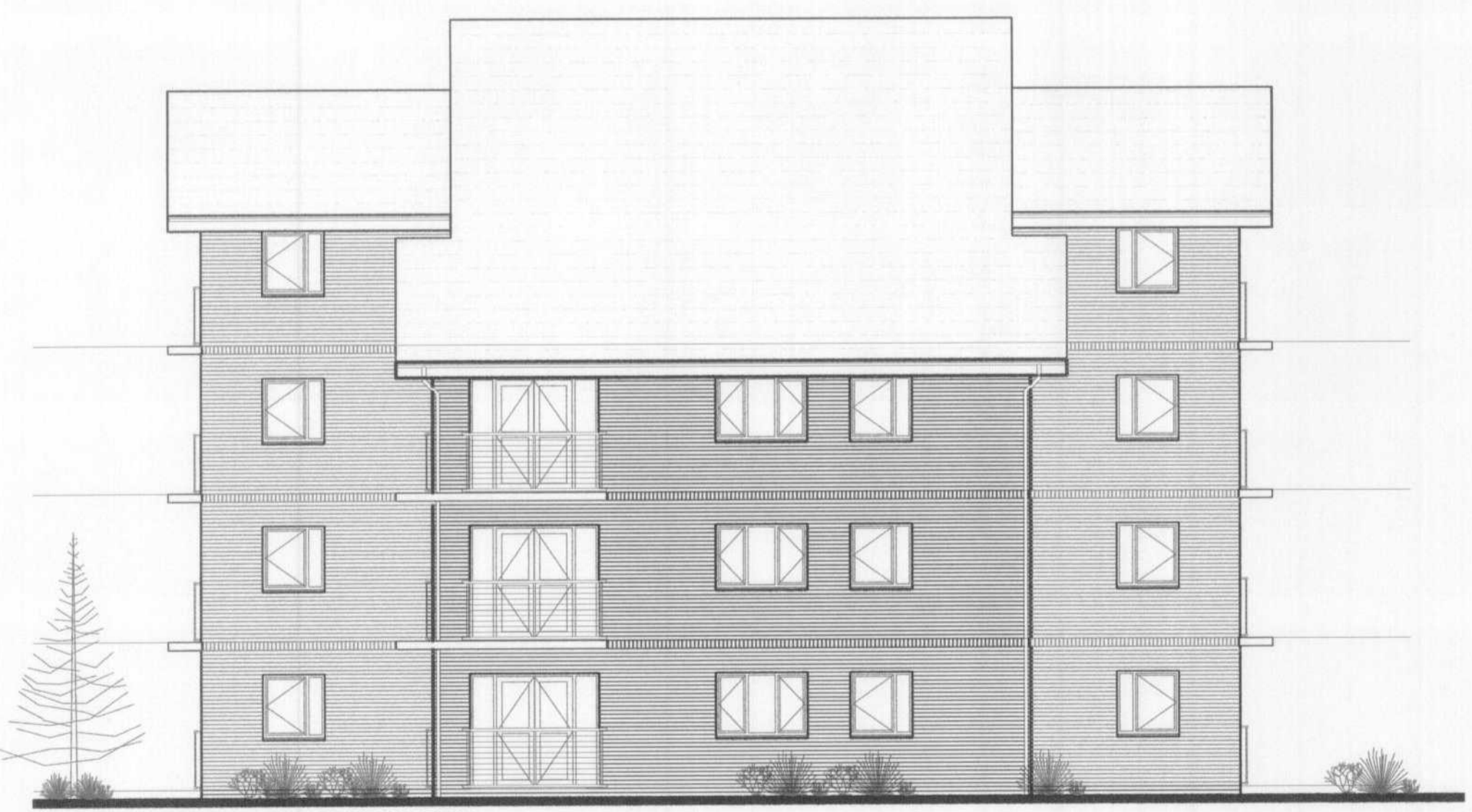
SOCIAL VARIANT - "REAR" ELEVATION UNIT 68-78

PLANNING SMC HICKTON MADELEY ARCHITECTS Britannia House 50 Great Charles Street Birmingham B3 2LT Client T: 0121 710 1810 F: 0121 710 1811 studio@hmarchitects.co.uk www.smhicktonmadeley.com Bovis Homes Midlands / Taylor Wimpey plc