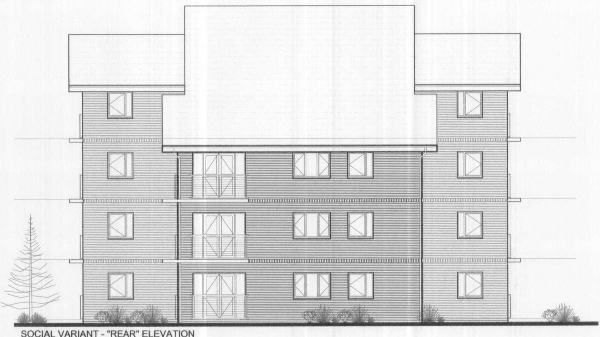
SOCIAL VARIANT - "REAR" ELEVATION