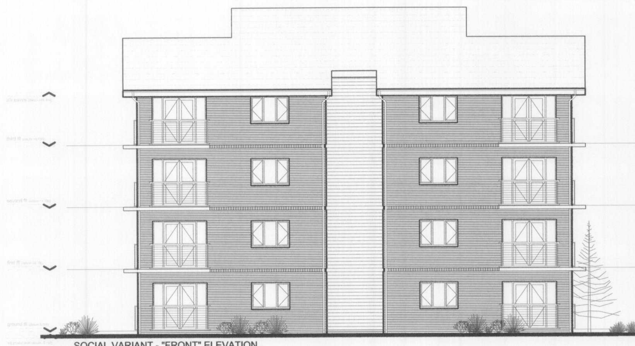
SOCIAL VARIANT - "FRONT" ELEVATION

MECHANICAL AND ELECTRICAL Mechanical and Electrical items are indicative only. For detailed layouts, please refer to Engineers Drawings.