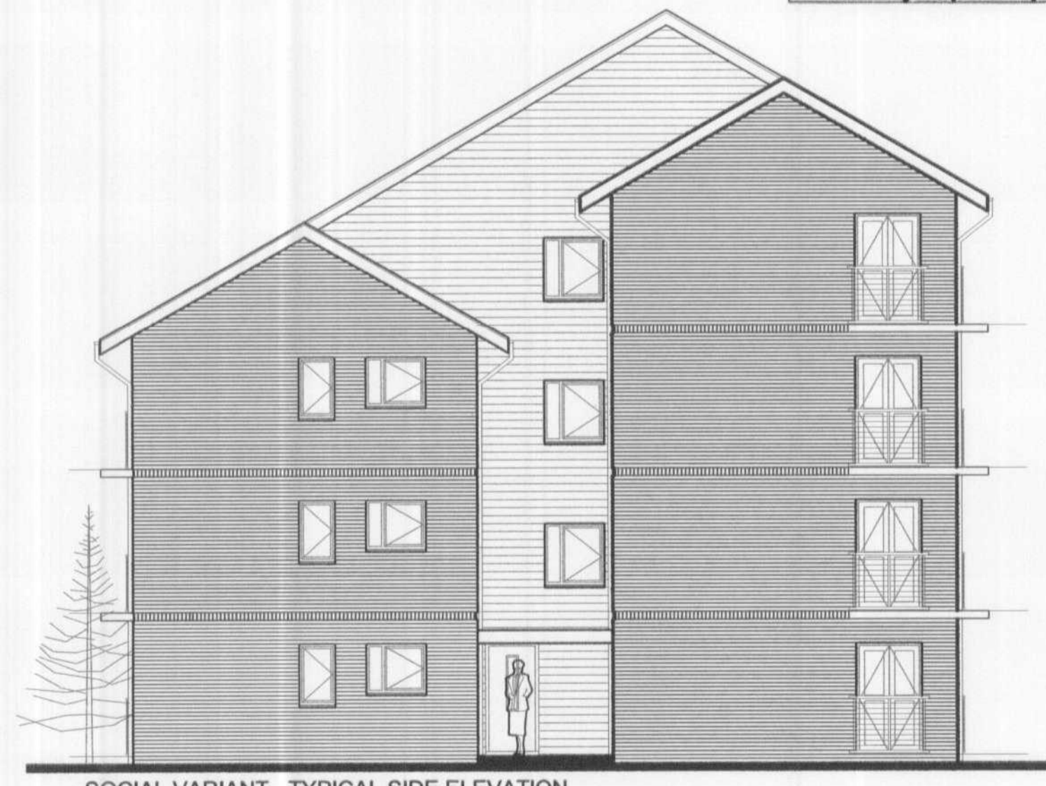
SOCIAL VARIANT - TYPICAL SIDE ELEVATION UNIT 68-78

Project Title Phases 3 & 4 Salisbury Village Hatfield Drawing Title "T" Block Apartments - Social Elevations SITE PLAN BUILDING TYPE D