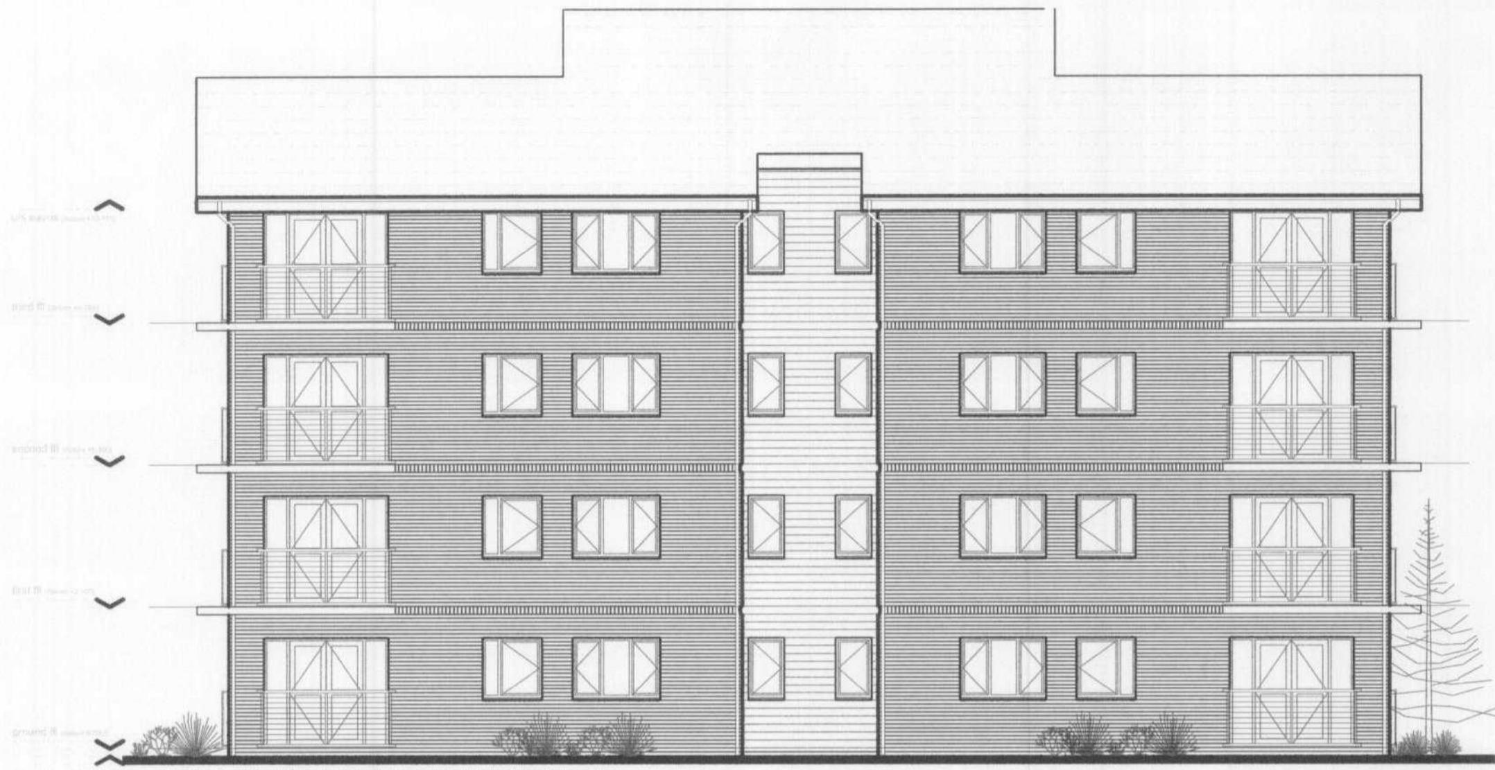
PRIVATE VARIANT - "FRONT" ELEVATION