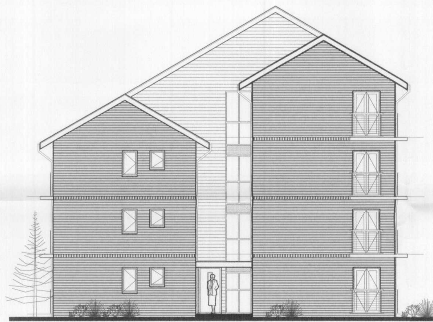
PRIVATE VARIANT - SIDE ELEVATION UNITS 150 - 160