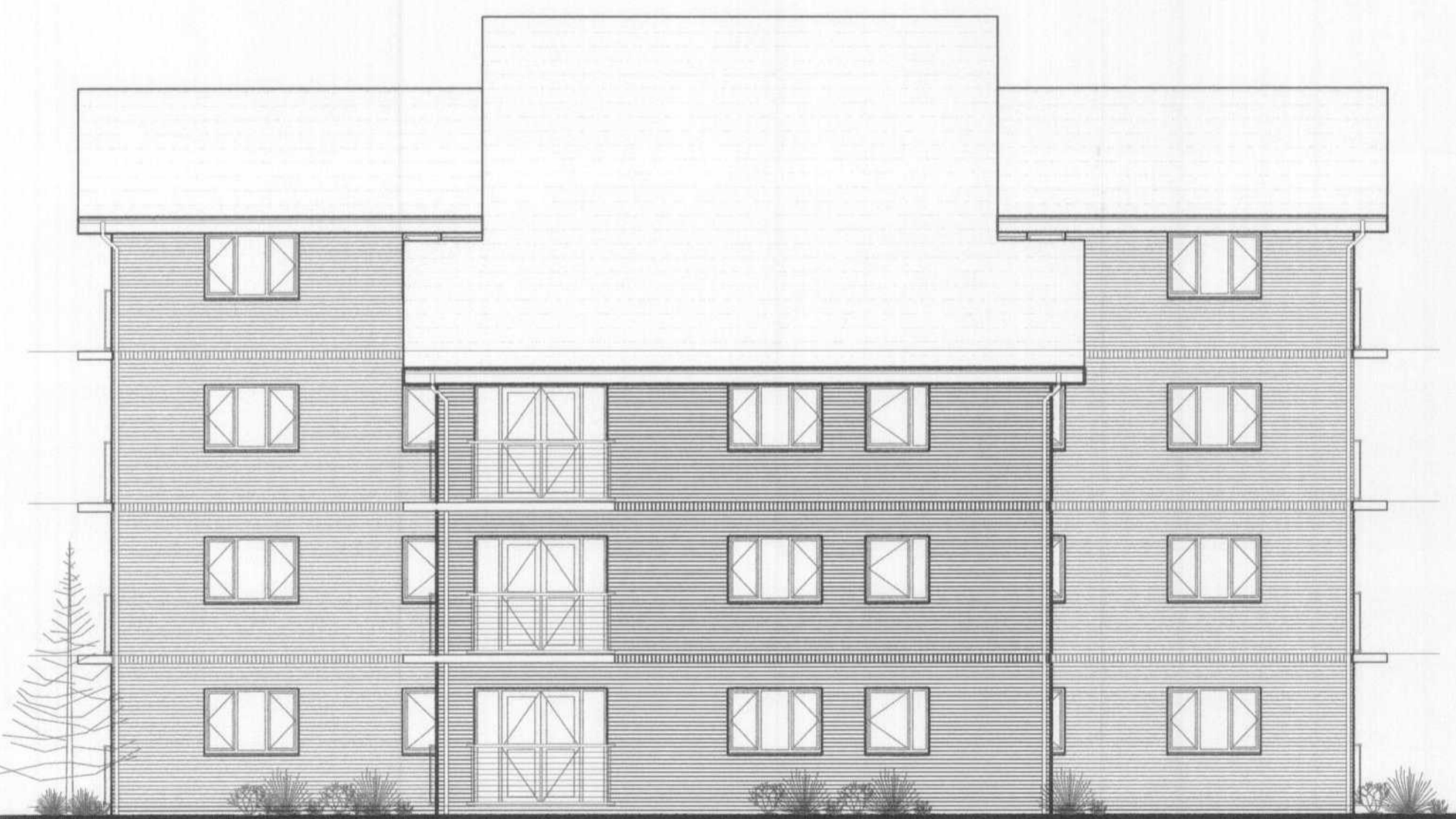
PRIVATE VARIANT - "REAR" ELEVATION UNIT 139-149

WELWYN HATFIELD PLANNING OFFICE COPY 17 SEP 2007 No: 501071661m PLANNING