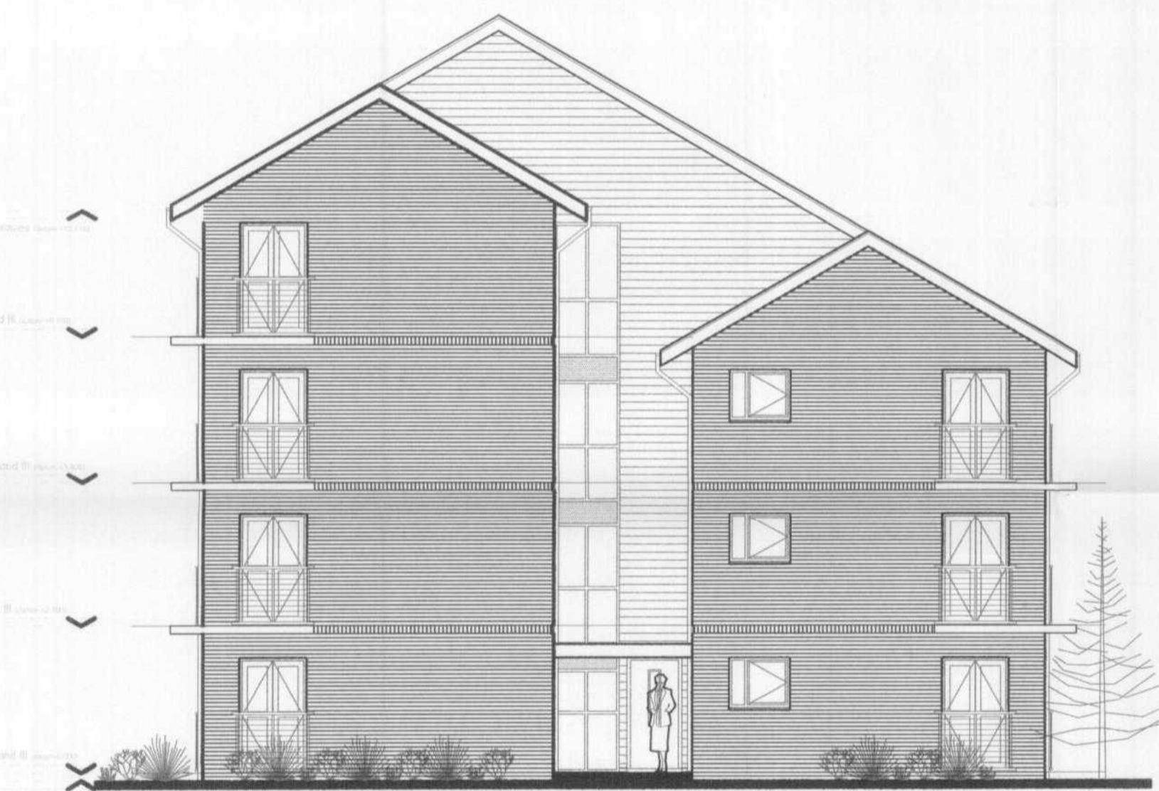
PRIVATE VARIANT - SIDE ELEVATION UNITS 35 - 45