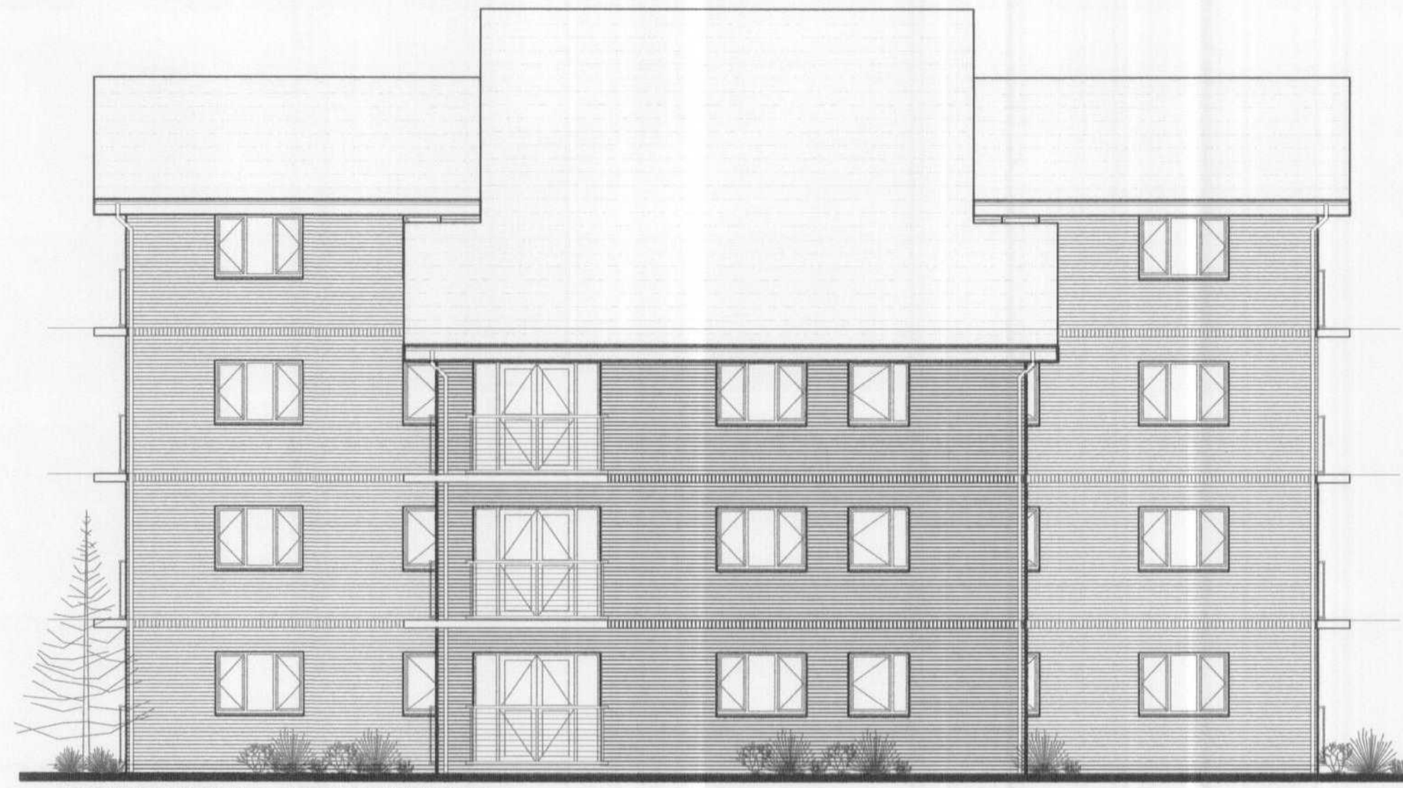
PRIVATE VARIANT - "REAR" ELEVATION UNIT 139-149

EXTERNAL FINISHES ELEVATIONS: Istock Hardwicke Welbeck Red Mixture wirecut Istock Staffordshire Slate Blue smooth (ground floor elevations to feature units) White Eternit timber-type Weatherboard (circulation elements / recessed features) ROOF: Eternit Birkdale dark grey tile WINDOWS: PVCu White PPC White Curtain Walling (end unit stair towers) BRISES SOLEIL: PPC White Aluminium fascia / Natural Aluminium Blades BALCONIES: PPC White Balusters / Rails GMS Safety Backing Mesh EXTERNAL DOORS: Timber gloss white