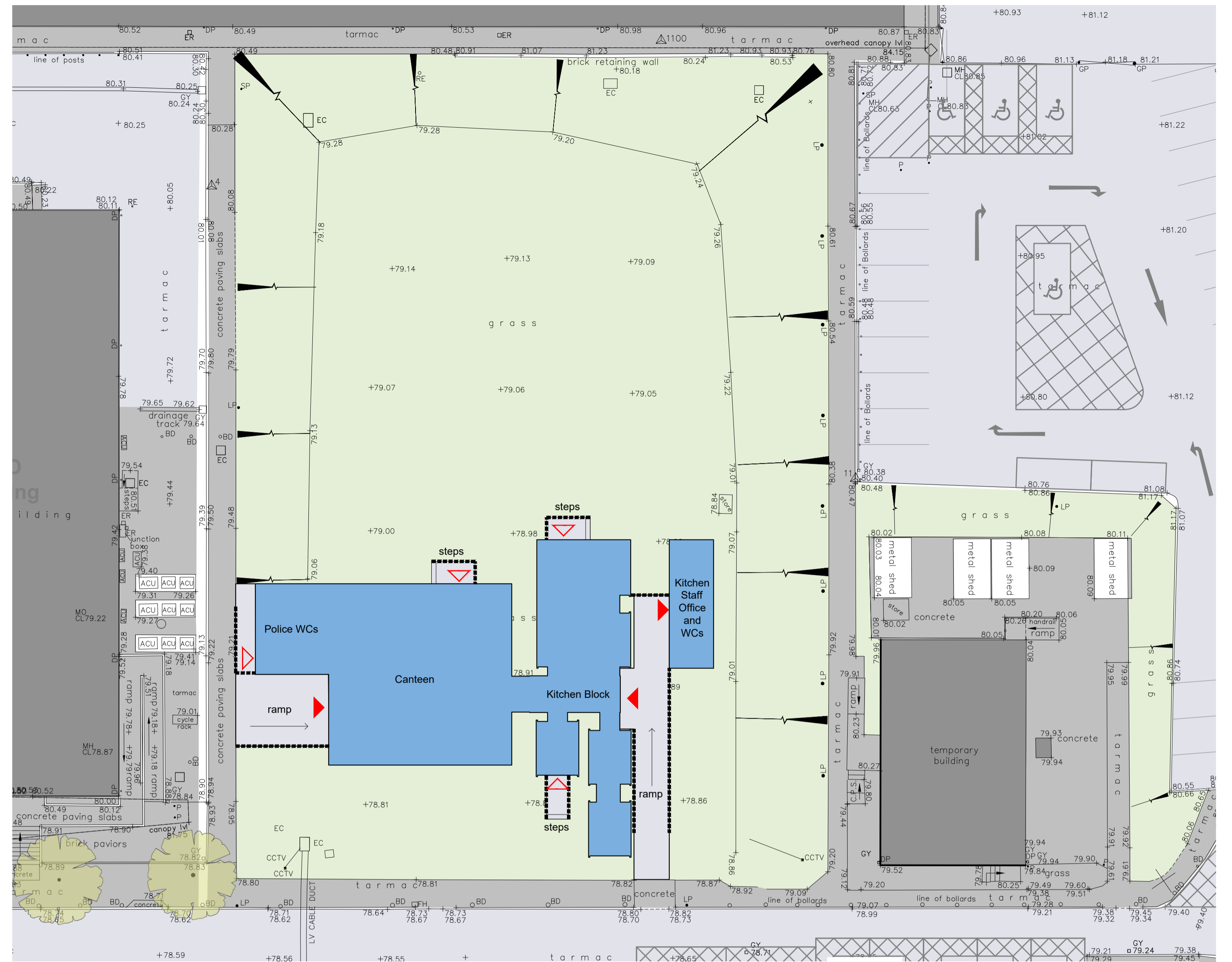
Extract of Proposed Site Plan.