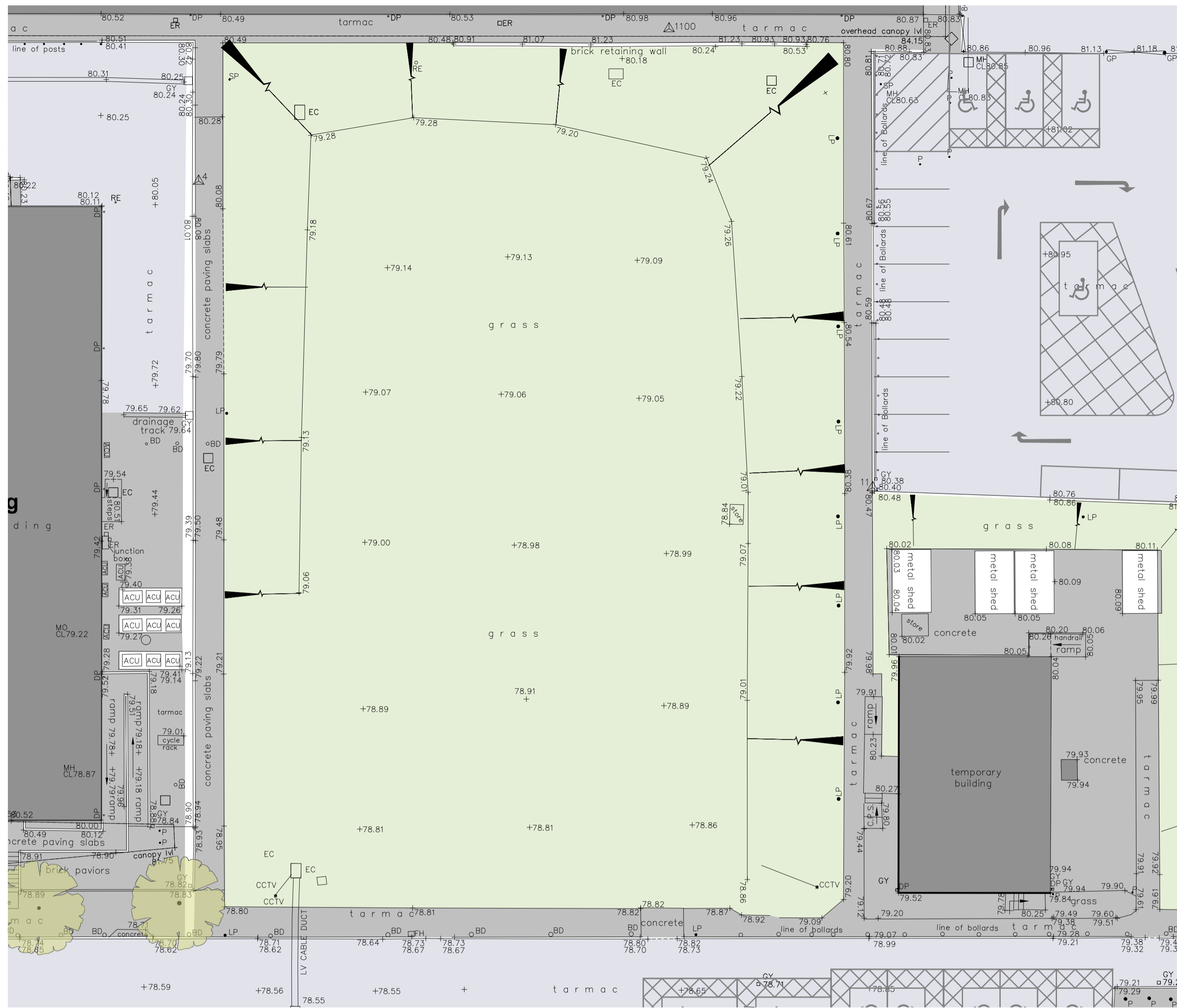
Extract of Existing Site Plan.