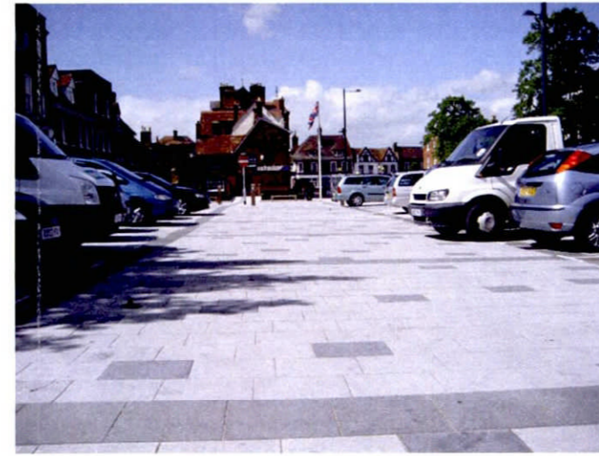
Marshalls 'Conservation' Granite paving