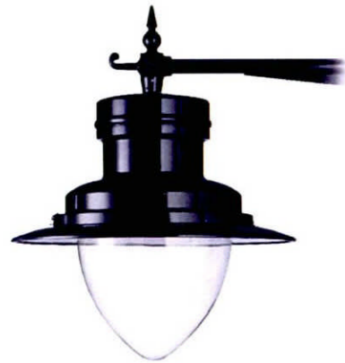
D W Winsdor - Strand A