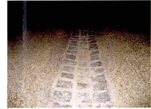
Marshalls 'Conservation' Granite sets as drainage channel