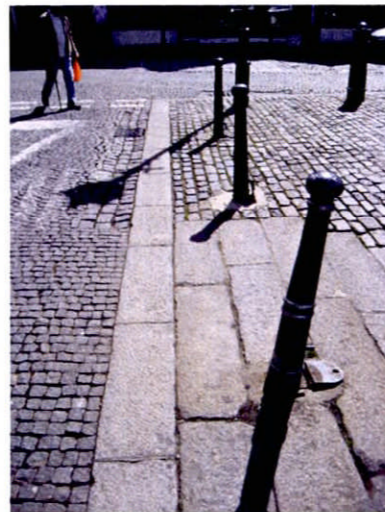
Marshalls 'Conservation' kerb