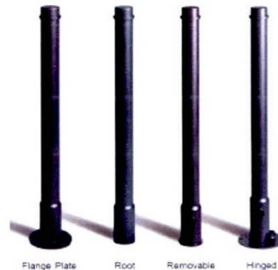
D W Winsdor - ISIS Hinged bollard