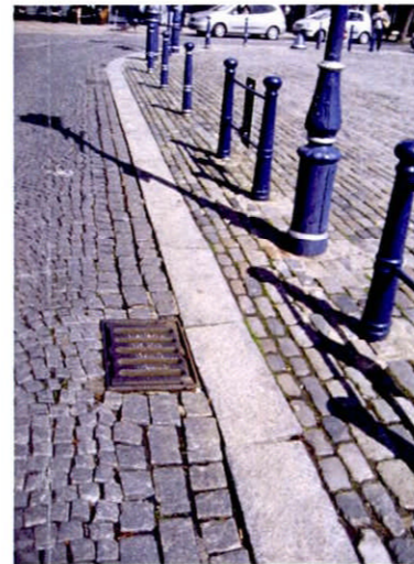
Marshalls 'Conservation' Granite sets, 'Conservation kerb' and Granite paving.