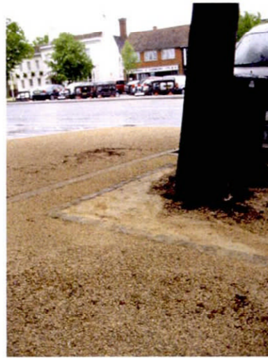
Resin bonded gravel, gravel layer or 'hogging' around trees