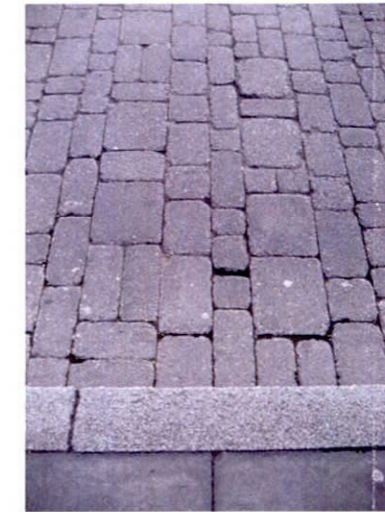
'Conservation' kerb & Granite sett paving