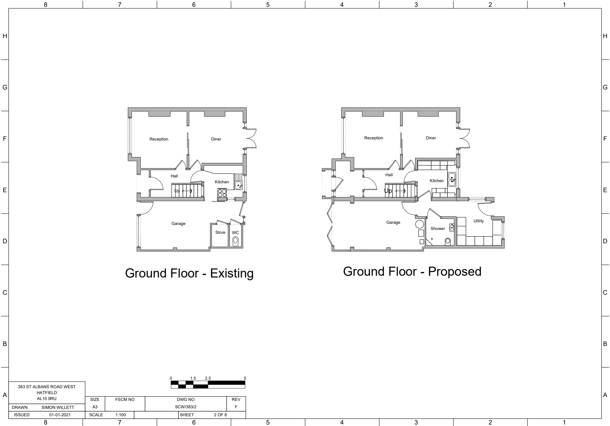
Ground Floor - Existing