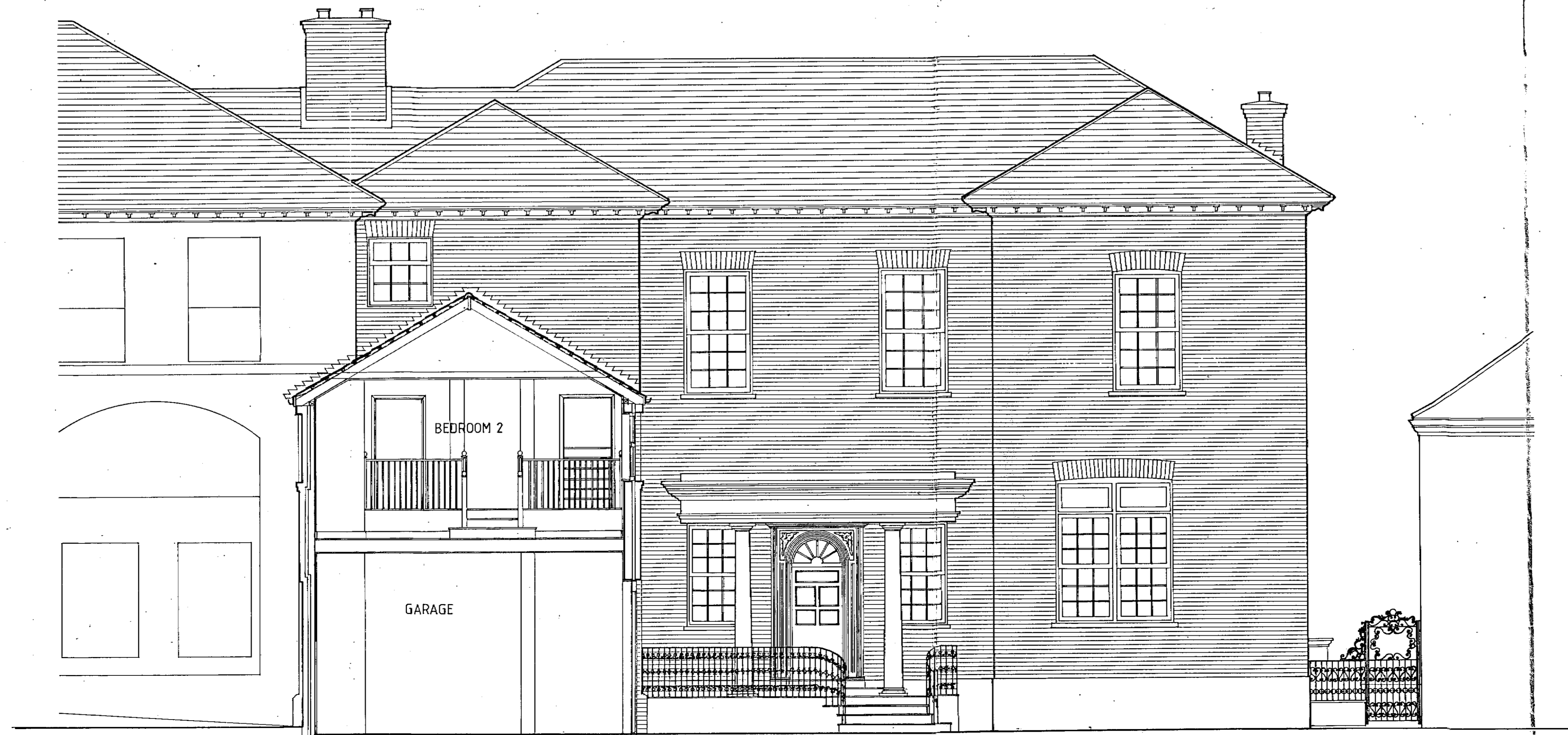
NORTH FACING ELEVATION AND SECTION