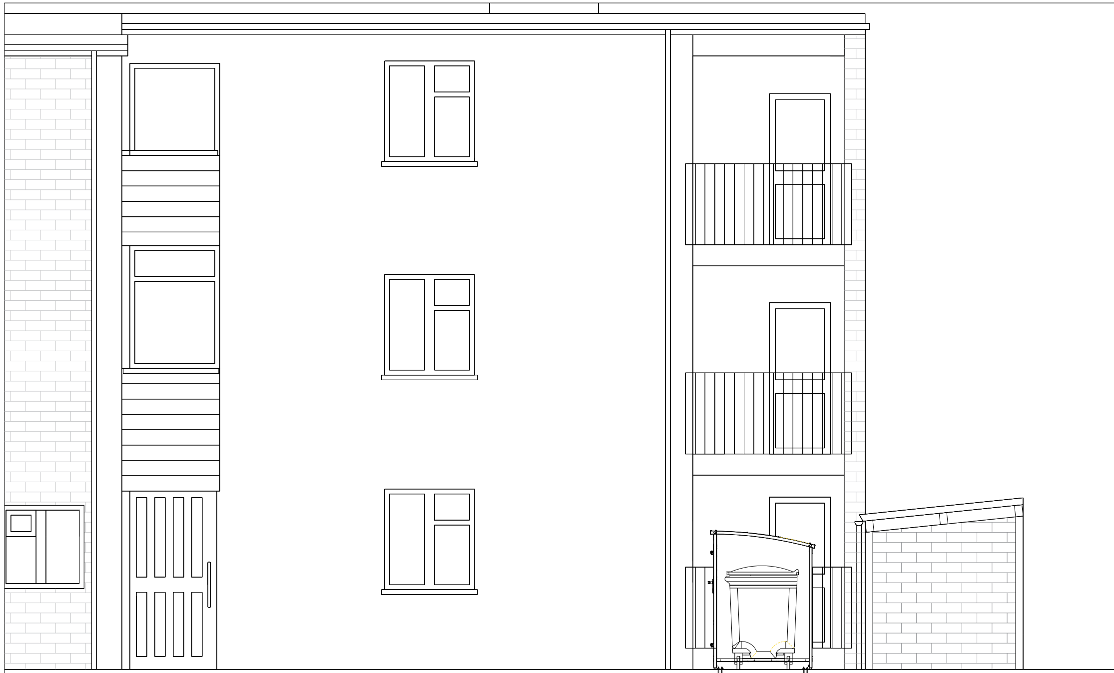
New Bin storage units