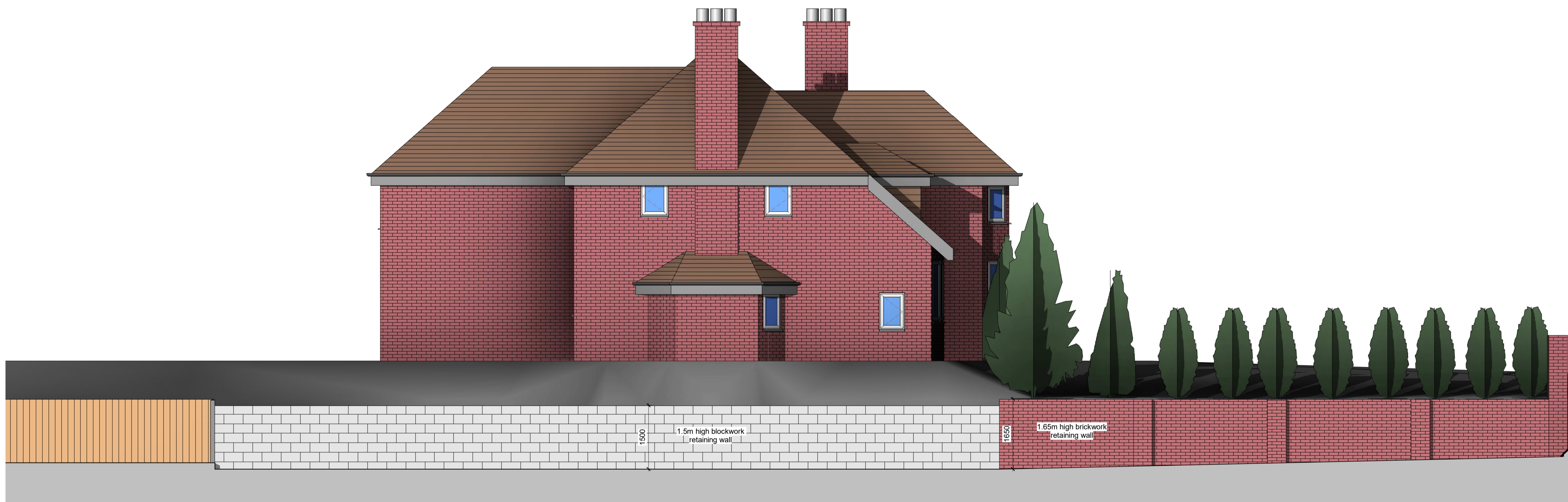
1 Retaining Wall Elevation Looking Towards 6 Hill Rise 1 : 50

Architectural Design London Chartered Building Engineer