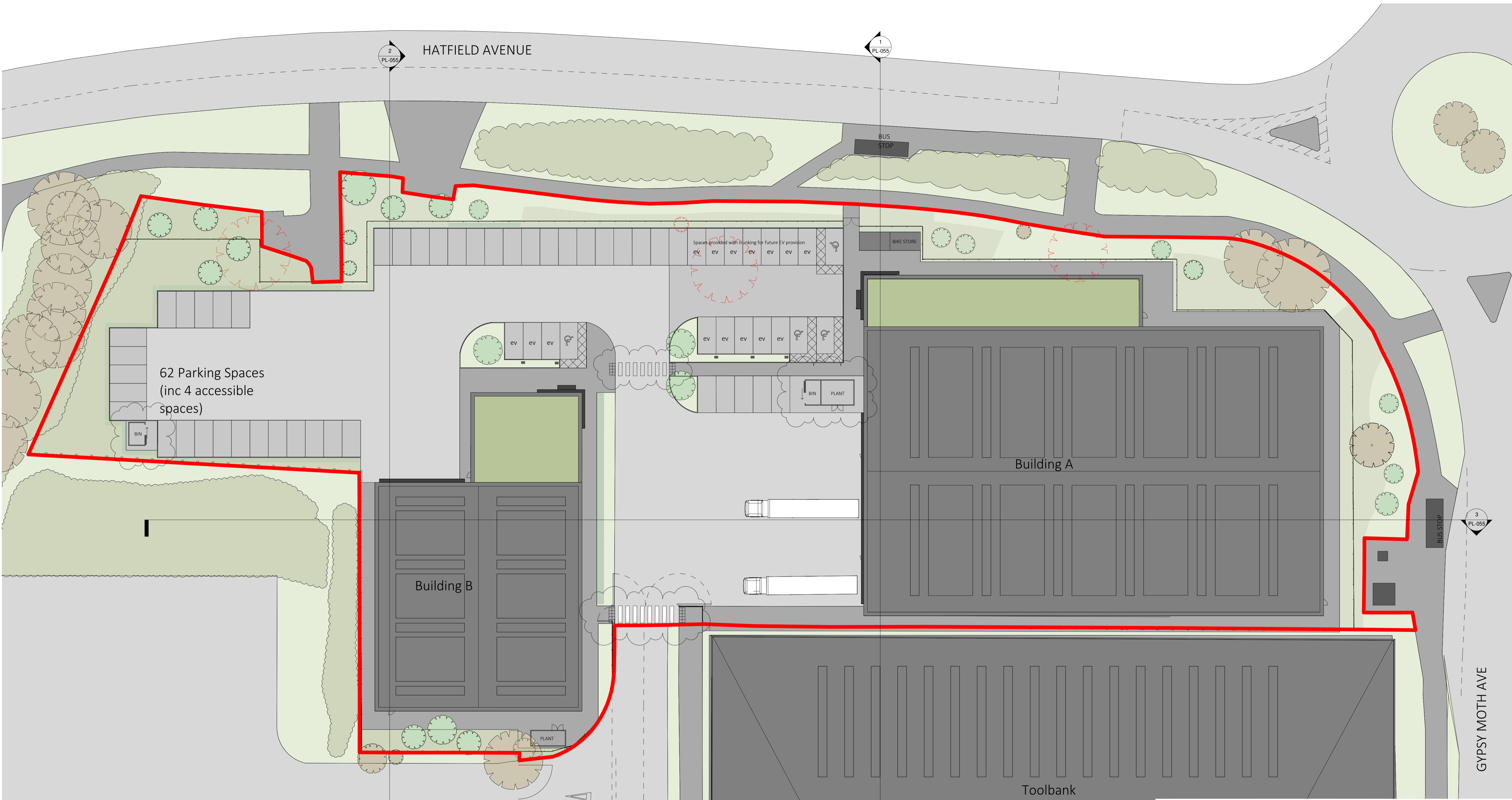
1 Proposed Site Plan 1 : 250